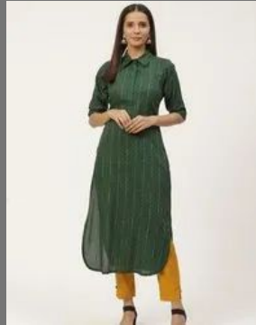
Silk Kurti Silk Cotton