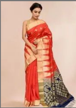
Silk Sareessilk Cotton