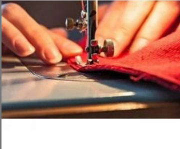
Stitching of Kurtis