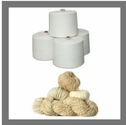
Cotton Yarns and Threads