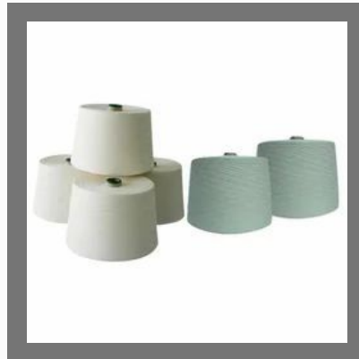
Polyester Cotton Yarns