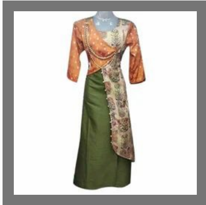
Ladies Designer Kurti