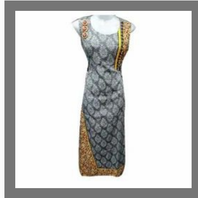
Sleeveless Cotton Kurti