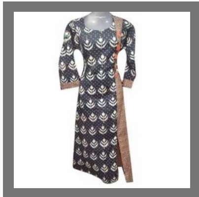
Printed Stylish Kurti