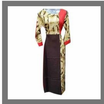
Printed Designer Kurti