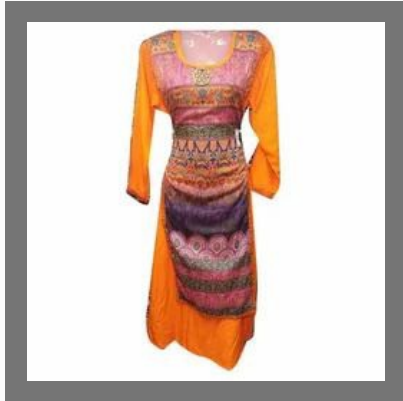
Trendy Cotton Kurti