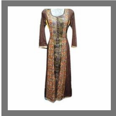
Designer Cotton Kurti