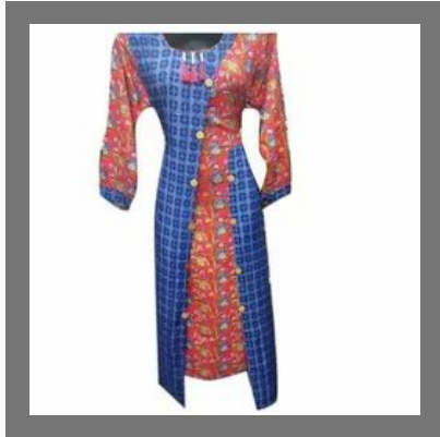
Rayon Long Kurti