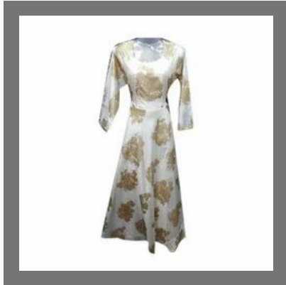
Ladies Frock Kurti