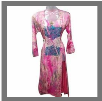
Printed Casual Kurti