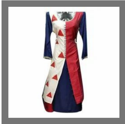
Ladies Fancy Kurti