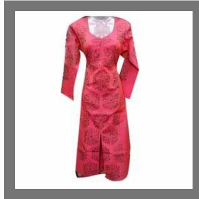
Ladies Chanderi Silk Kurti