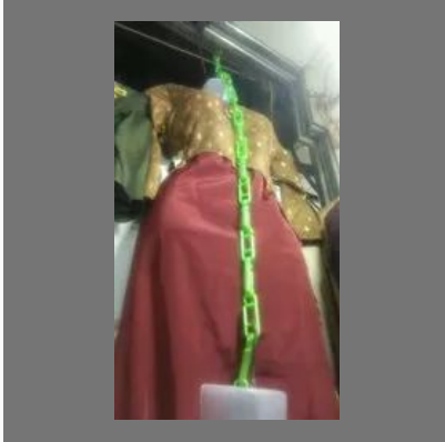
Imported ladies kurties