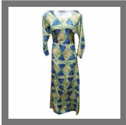
Stylish Rayon Kurti