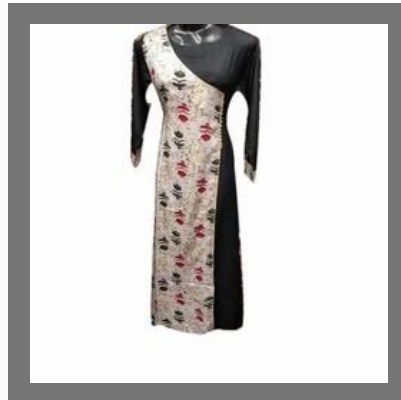
Printed Cotton Kurti