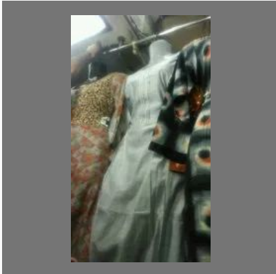
Imported ladies kurties