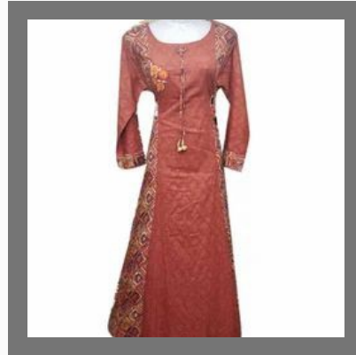
Stylish Cotton Kurti