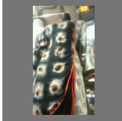
Imported ladies kurties