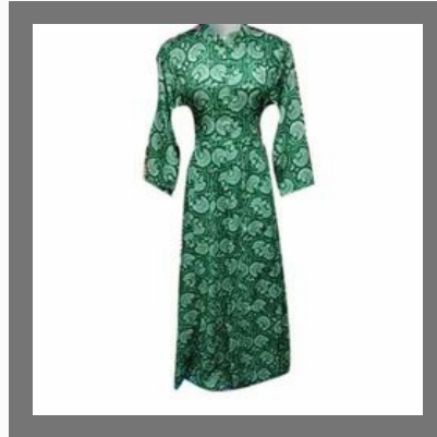
Printed Trendy Kurti