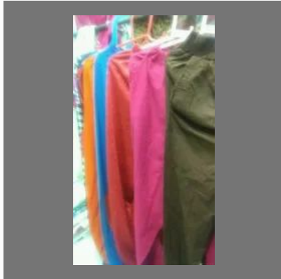
Imported ladies kurties