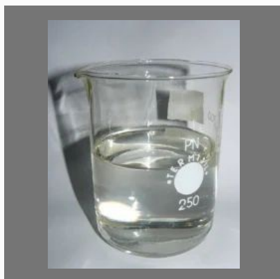
Chemical Grade Diethylenetriaminepentaacetic Acid