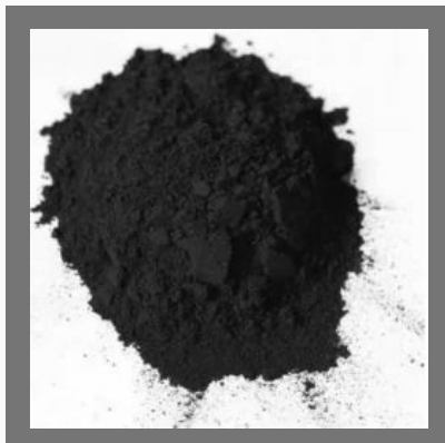
Black Silver Oxide