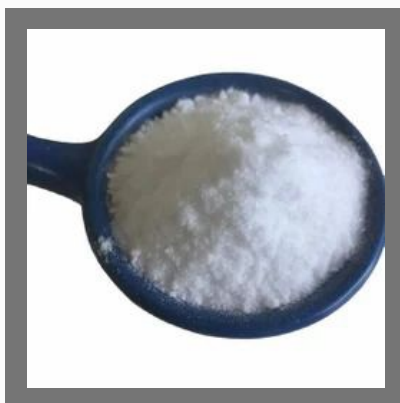
White Silver Nitrate Powder