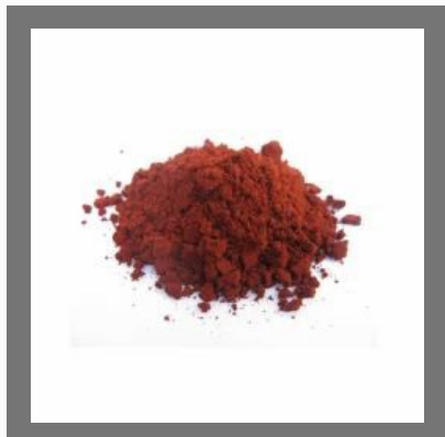
Palladium Chloride Powder