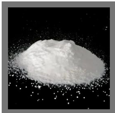
White Magnesium Acetate