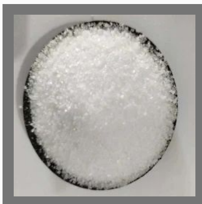
White Potassium Chloride