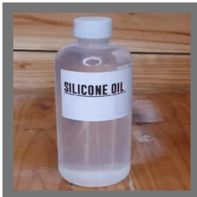
500ml Silicone Oil