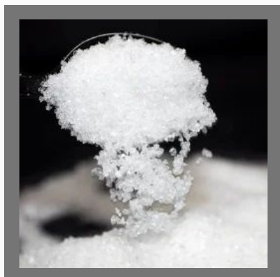
White Calcium Acetate