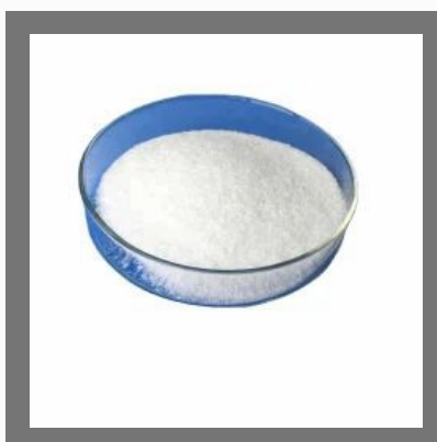
White LR Grade Ammonium Acetate