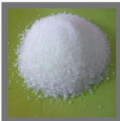
White Ammonium Sulphate