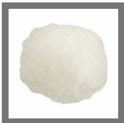
White Diammonium Phosphate