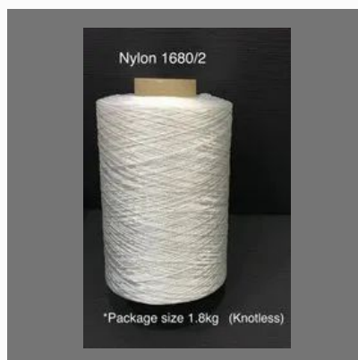
Nylon 1680/2 Cord