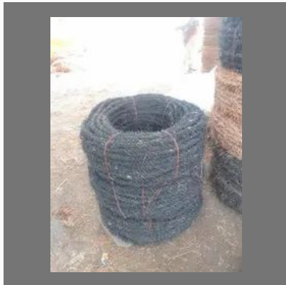
Nylon Tyre Cord Rope 10-12mm (300 Ft)