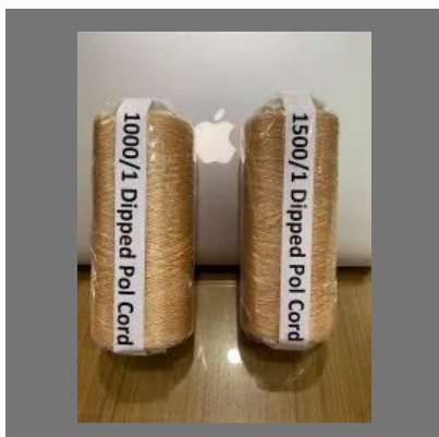
Polyester Dipped Cord