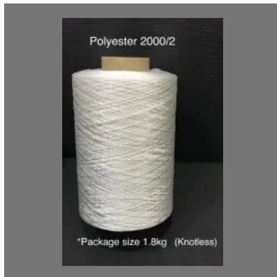
Polyester 2000/2 Cord