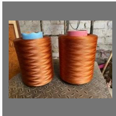
Nylon / Polyester Dipped Yarn