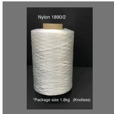
Nylon 1890/2 Cord