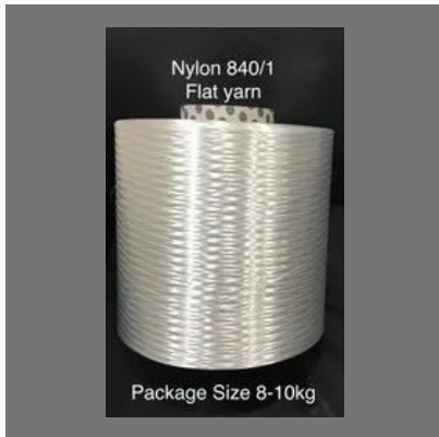
Nylon 840/1 Flat Yarn