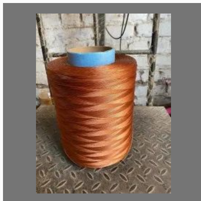
Polyester / Nylon Dipped Yarn