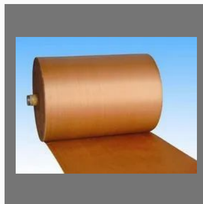
Dipped nylon Conveyor Belting Fabric