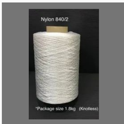
Nylon 840/2 Knotless Cord