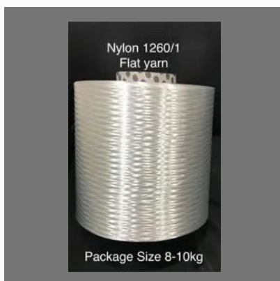
Nylon 1260/1 Flat Yarn