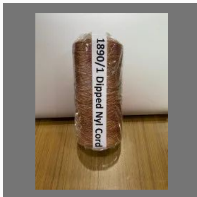
Nylon Dipped Cord