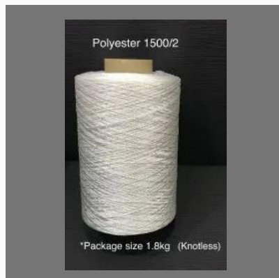
Polyester 1500/2 Cord