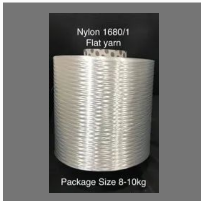
Nylon 1680/1 Flat Yarn