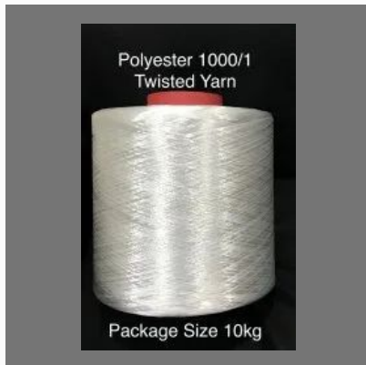
Polyester 1000/1 Twisted Yarn