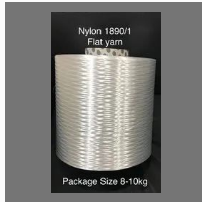
Nylon 1890/1 Flat Yarn