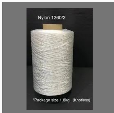
Nylon 1260/2 Cord