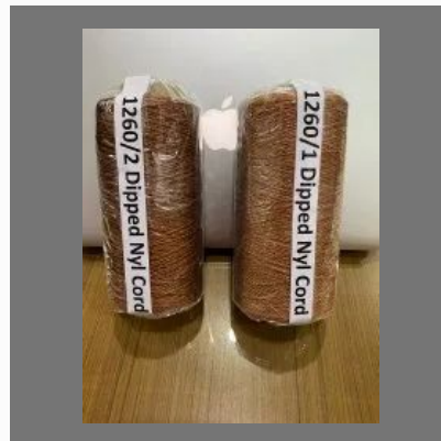
Nylon Dipped Cord