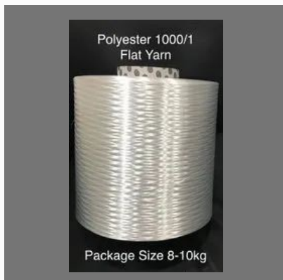
Polyester 1000/1 Flat yarn