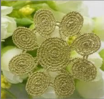
Garment Silk Laces