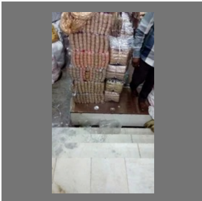
Embroidered Zari Laces