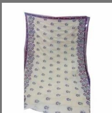
Kolkata Embroidered Sarees