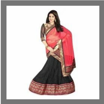
Latest Girlish Lehenga