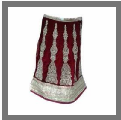
Exclusive Bridal Lehenga