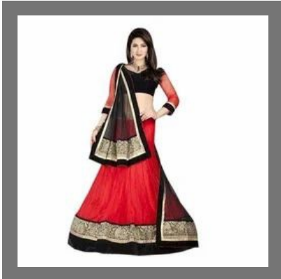
Stylish Girlish Lehenga