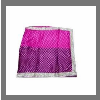
Heavy Border Saree