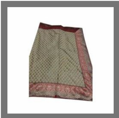
Exclusive Border Saree