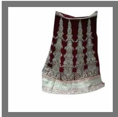
Designer Bridal Lehenga