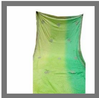
Stylish Hand Embroidered Sarees