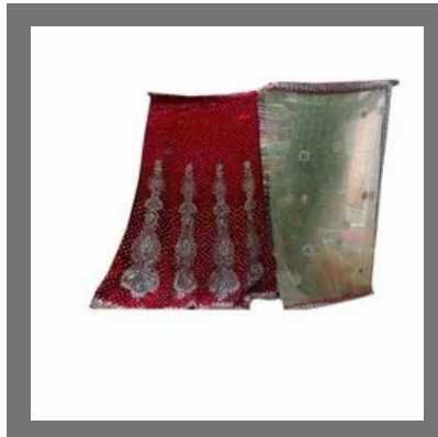
Fashionable Lehenga Sarees