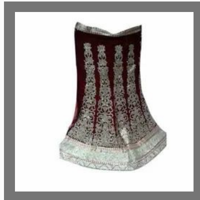
Fashionable Bridal Lehenga