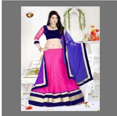
Exclusive Girlish Lehenga