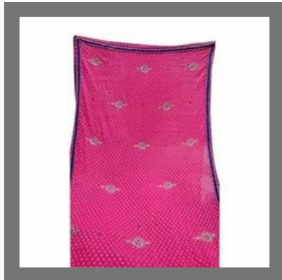
Modern Hand Embroidered Sarees