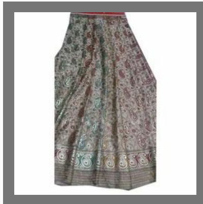
Modern Printed Saree