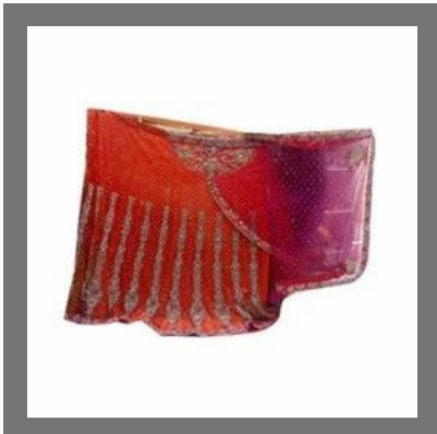
Exclusive Lehenga Sarees