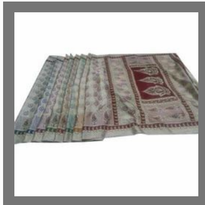
Fancy Printed Saree