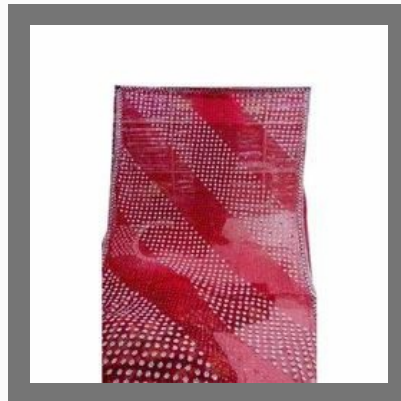
Exclusive Hand Embroidered Sarees