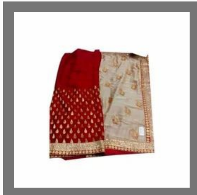
Stylish Border Saree