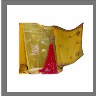
Designer Lehenga Sarees