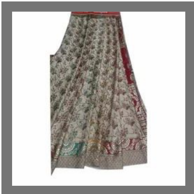
Fancy Printed Sarees