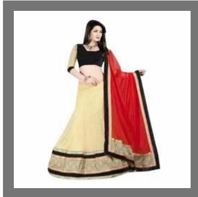
Fashionable Girlish Lehenga