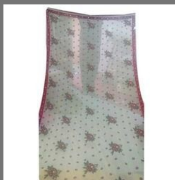
Stylish Kolkata Embroidered Sarees