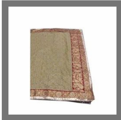
Fancy Border Saree