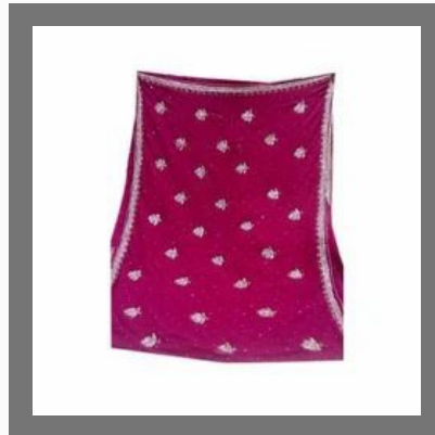
Fashionable Hand Embroidered Sarees