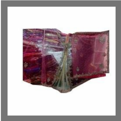
Stylish Lehenga Sarees