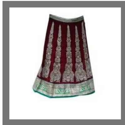
Stylish Bridal Lehenga