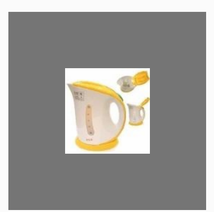
Cordless Electric Kettle