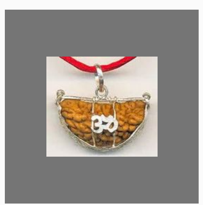
Eka Mukhi Rudrakshya