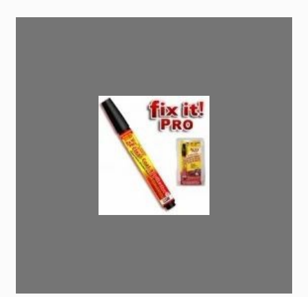
Scratch Remover Pen