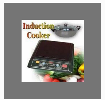
Induction Cooker- Manual