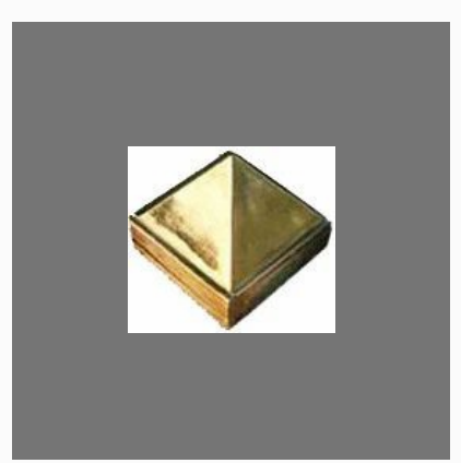
Energy Generating Pyramid