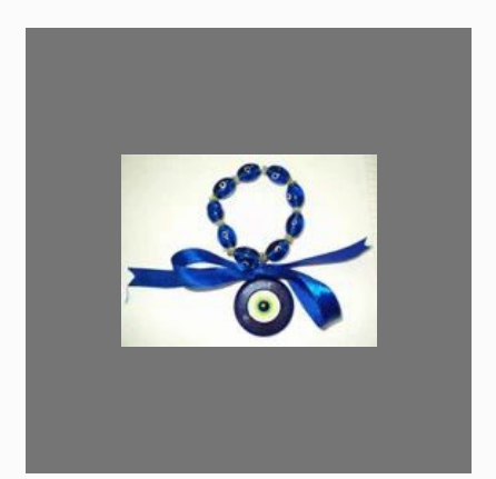
Nazar Suraksha Kavacha