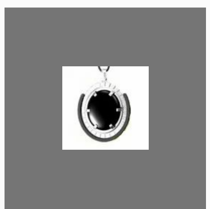
Shani Suraksha Kavacha