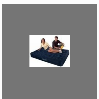
Intex Air Bed