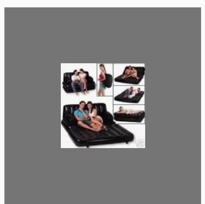
5 in 1 Air Sofa Bed