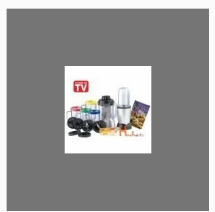
Magic Food Processor