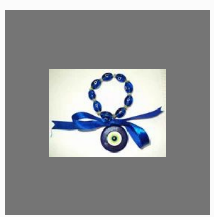
Nazar Suraksha Kavacha