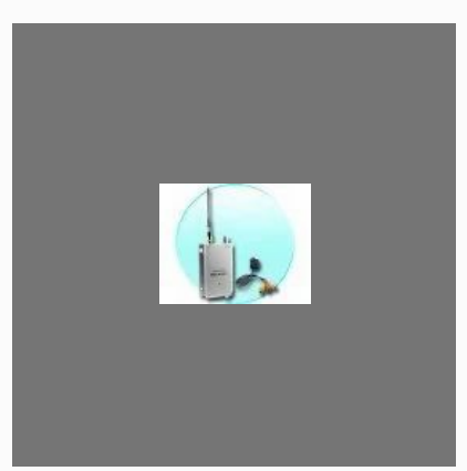
Micro 1 2GHz Wireless Pinhole