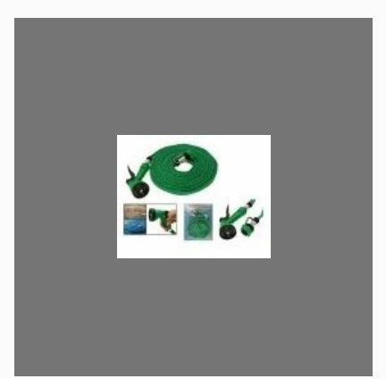
15 Meter 4 Mode Hose Pipe Water Sprayer for Garden & Car