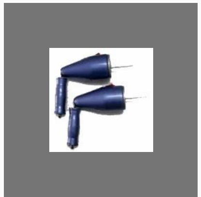
Vedic Aura Scanner