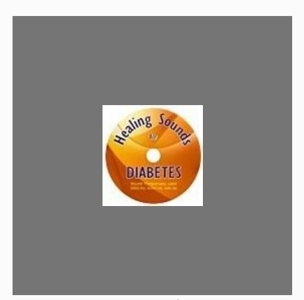
Disease Healing Sound