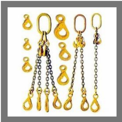
Lifting Chain Slings