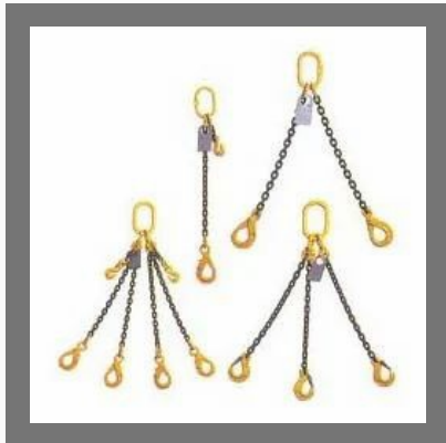
Multi Leg Slings