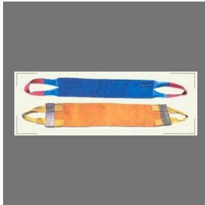
Special Purpose Slings