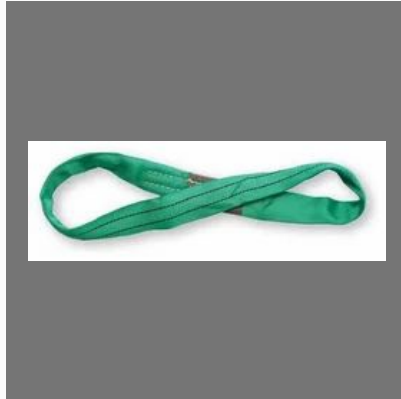
Polyester Round Slings