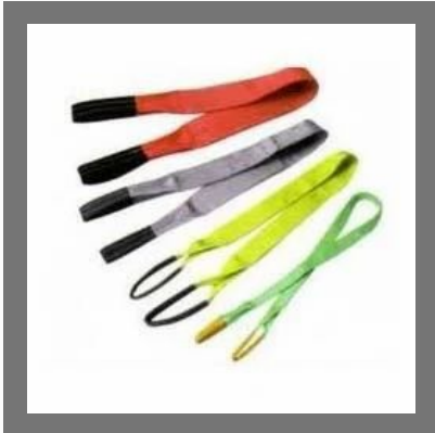
Polyester Webbing Slings