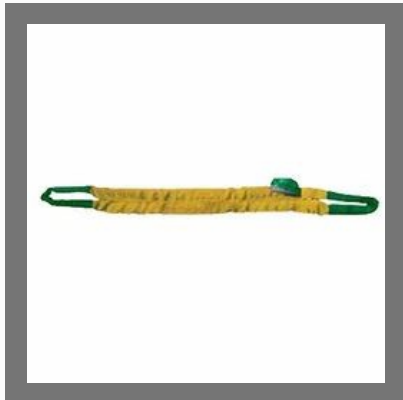
Parallel Lane Slings