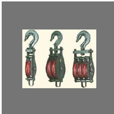
Manila Rope Pulley Block