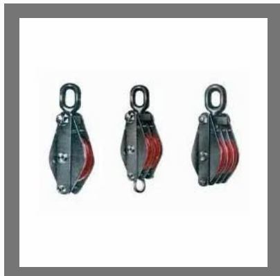
Wire Rope Pulley Blocks