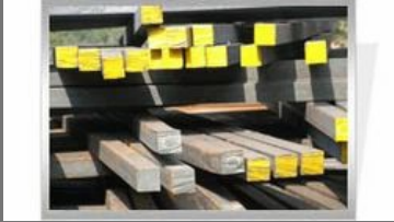
MS Billets and Blooms