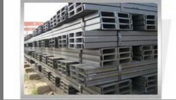
Round Wire Road & Structural