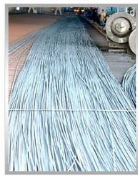
Value for money with Fe 415