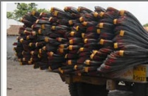
Rust and Corrosion Resistant