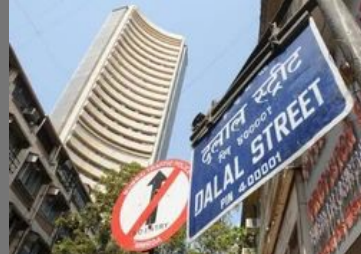
Indian Commodity Market Tips