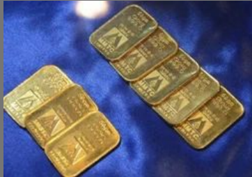
Commodity Tips On Mobile