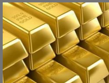
Commodity Free Tips On Mobile