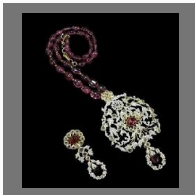
Pendant Set 001