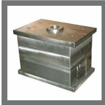
Die Casting Moulds