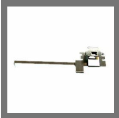
Metal Press Tools