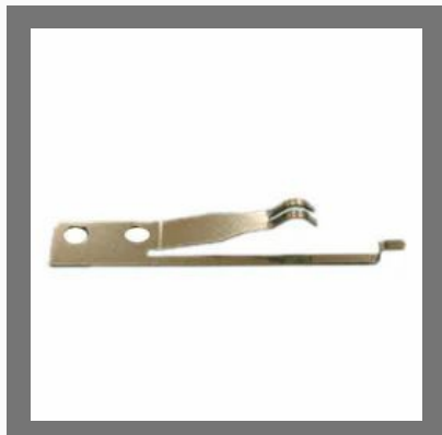
Metal Press Tools