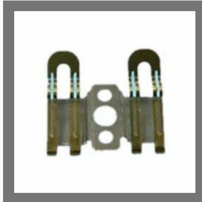
Metal Press Tools