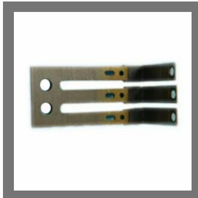
Metal Press Tools