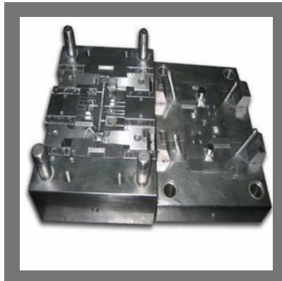
Precision Die Casting Moulds