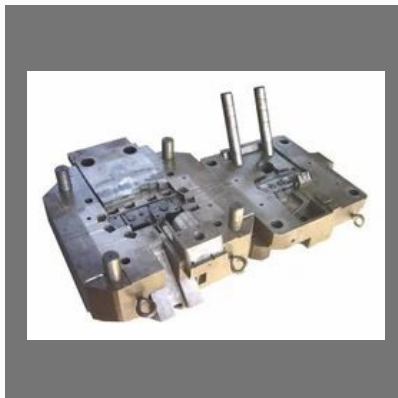
Aluminum Die Casting Moulds