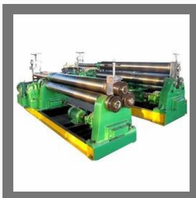
Sheet Rolling Machine