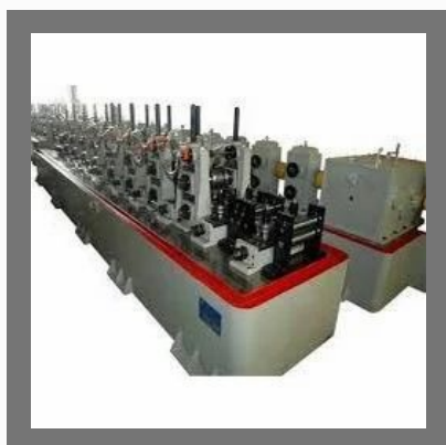
SS Tube Pipe Mill