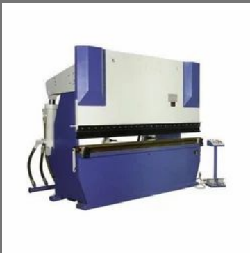
Hydraulic Bending Machine