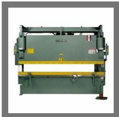
Hydraulic Press Brake Machine