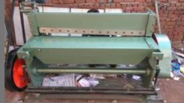
Under Crank Shearing Machine