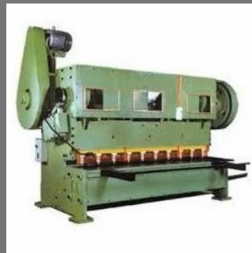
Power Shearing Machine