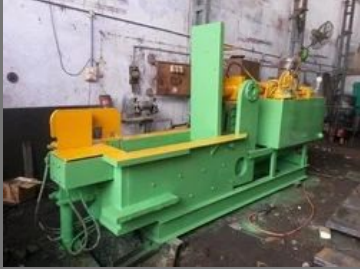
Double Action Bailing Machine (automatic)