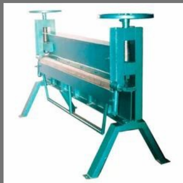
Sheet Bending Machine