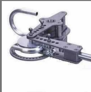
Pipe Bending Machine