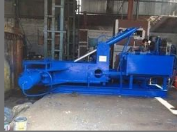
Triple Action Bailing Machine