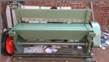
Under Crank Shearing Machine