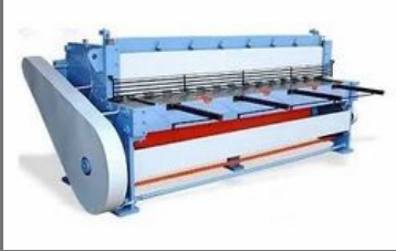
Mechanical Shearing Machine