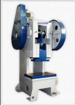
Power Press Machine