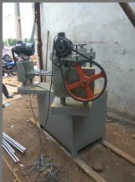
Pipe Straightening Machine