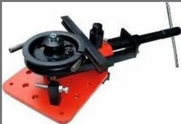
Manual Pipe Bender