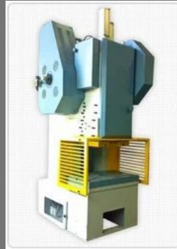
Pillar Type Power Press Machine