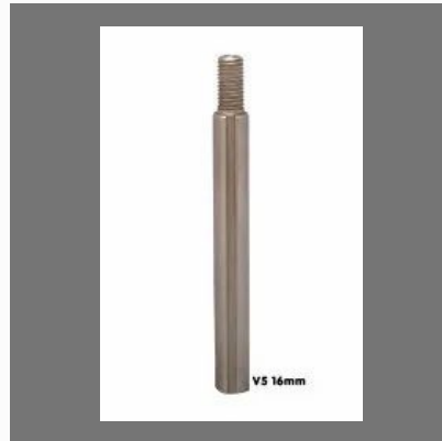
V5 16mm Pump Shaft