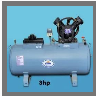
3hp Two Stage Air Compressor