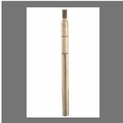
Mud Pump Shaft