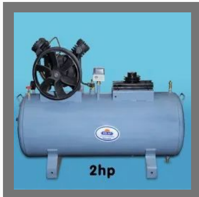
V Type single stage Piston Air Compressor