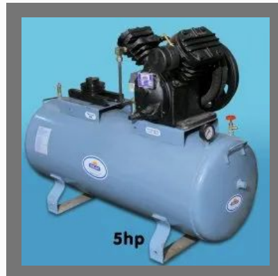
5hp Two Stage Air Compressor