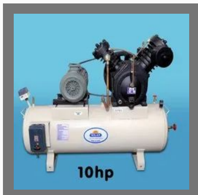
10HP Two Stage Piston Air Compressor