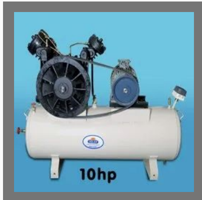
10hp Two Stage Solar Air Compressor