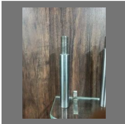
V-6 submersible pump shaft