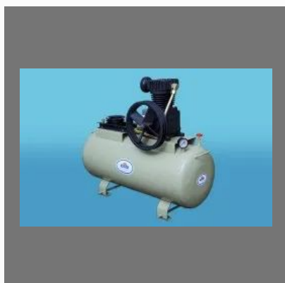
1 H.p Double Piston Air Compressor