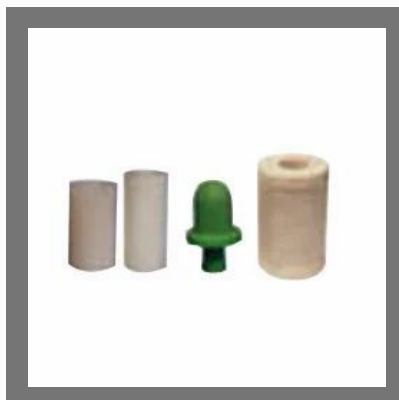
Candles For Water Filters