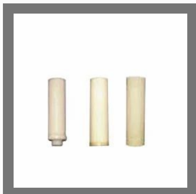
Porous Plastic Candles