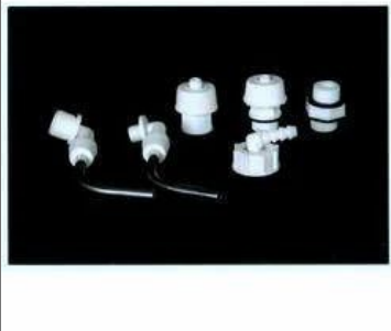
Water Purifiers Fitting