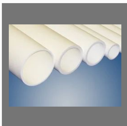
Porous Plastic Tubes