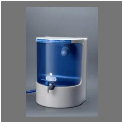
Dolphin Water Purifier