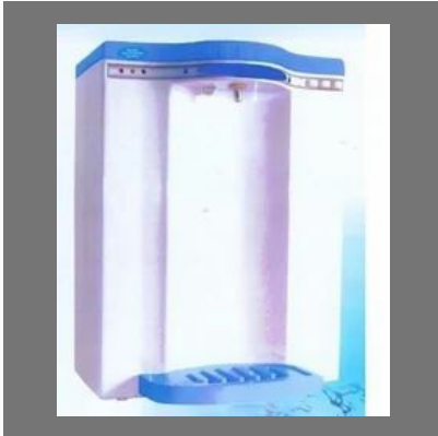
UV Water Purifier