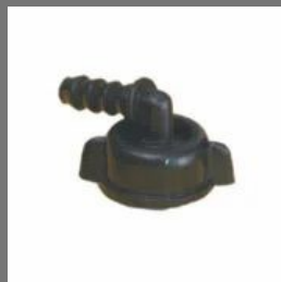
Water Purifier Valve