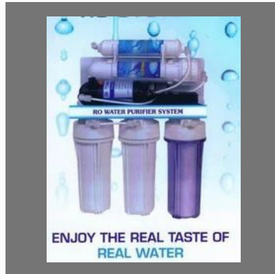
RO Water Purifier