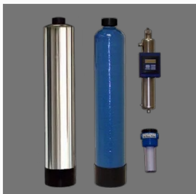
Water Filter Components