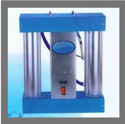
3 Stage Water Purifier