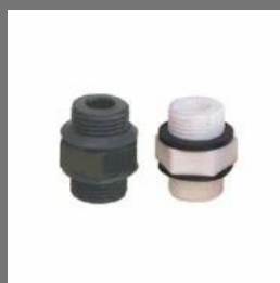
Water Purifier Fitting