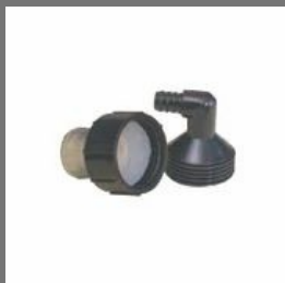
Water Purifier Connector