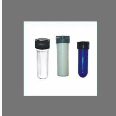
Industrial Water Filters