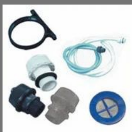
Carbon Chamber Mesh