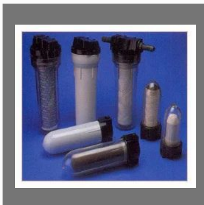
Water Filter Cartridges