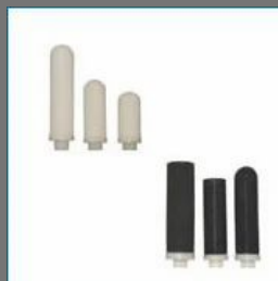
Small Filter Candles