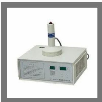
Induction, Sealer Manual Small DGYF-S500A