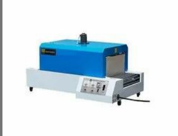
Shrink Tunnel 6 X 8 BS-B200