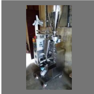
Form Fill Seal Cup Filling Machine