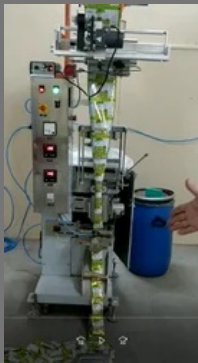
Pneumatic Pouch Packing Machine