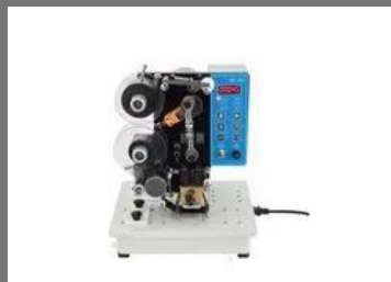
Hot Code Printer HP-2411