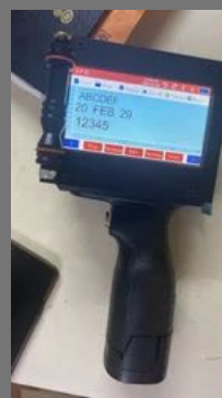
Handheld Inkjet Batch Coding Machine