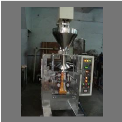
Food Packaging Machines