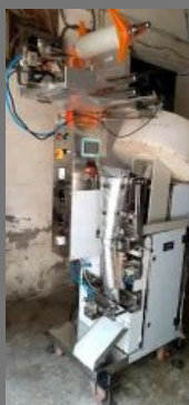
Pneumatic Powder Packing Machines