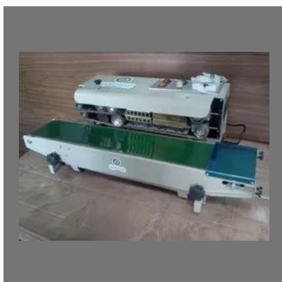
Horizontal/Vertical Band Sealer (Available In MS/SS Body)