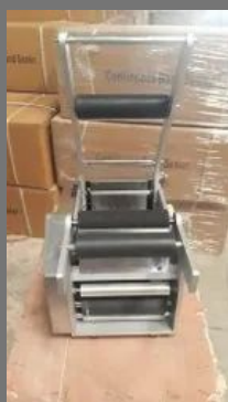
Semiauto Round Bottle Labelling Machine