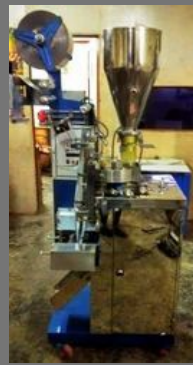
Sachets Packing Machine