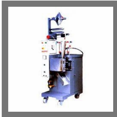
Automatic Form Fill & Seal Machine