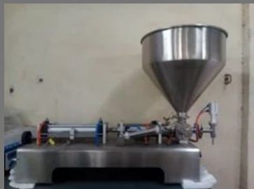
PNEUMATIC SEMI AUTO PASTE FILLING MACHINE