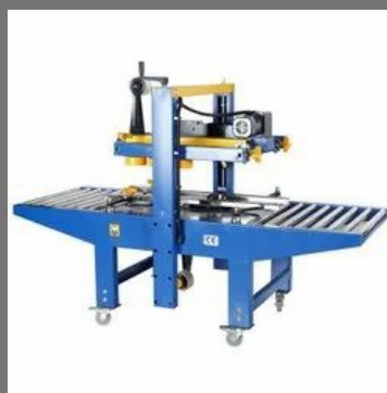
Cartoon Sealing Machine