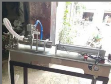
Semi- Automatic Liquid Filling Machine