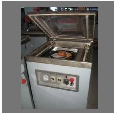
Vacuum Packaging Single Chamber