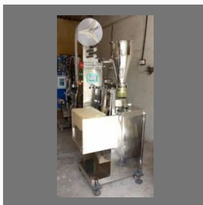
Mechanical Pouch Packaging Machine