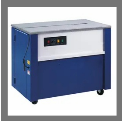
Semi Automatic Strapping Machine