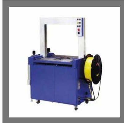
Fully Automatic Box Strapping Machine