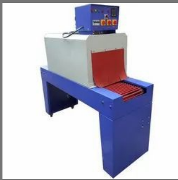
Chamber Type Shrink Tunnel 2 in 1. FM5540