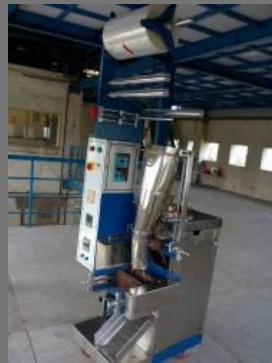
Packaging Machine for Shampoo