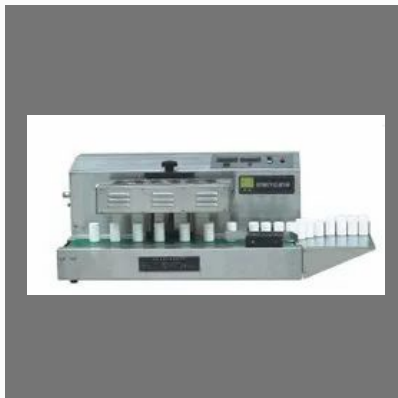
Automatic Induction, Sealer Small LGYF-1500 A-1