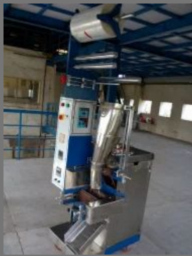
Vertical Pouch Sachet Packing Machines