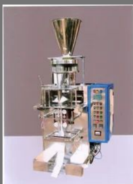
Powder Packaging Machine