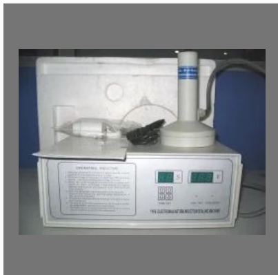
Manual Induction Sealer Machine