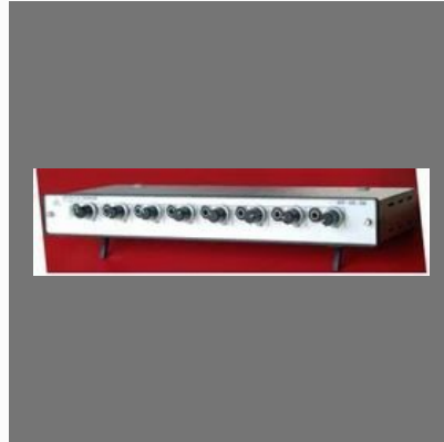
8 Channel Analog Input Simulator