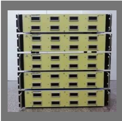
Instrumentation Product Design & Support Services