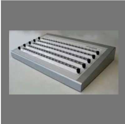
Digital Input Simulator (100 Chl / 16 Chl)