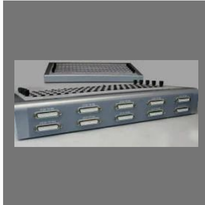
Digital Output Simulator (100 Chl / 16 Chl)