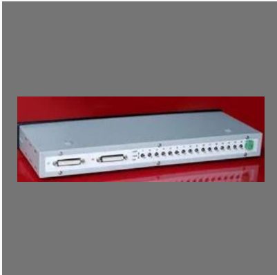
16 Channel Digital Input Simulator