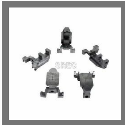
CNC Machined Component