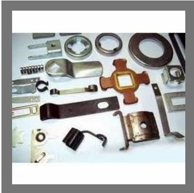
Industrial Sheet Metal Component