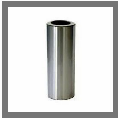
Piston/ Crank/ Gudgeon Pins