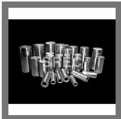
Piston Pins Crank Pins & Gudgeon Pins