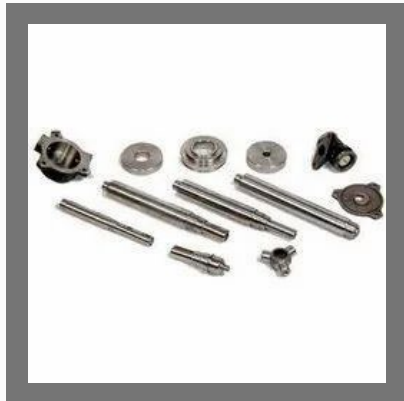
CNC Piston Rod