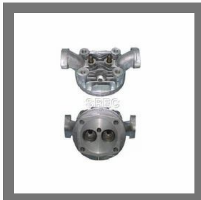
Aluminium Cylinder Heads