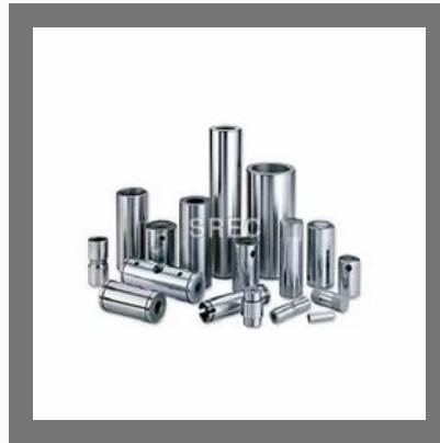
Piston Pins Crank Pins & Gudgeon Pin