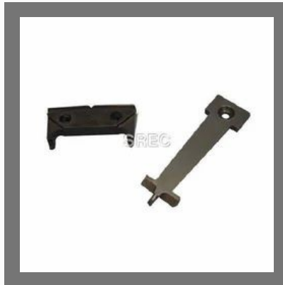
CNC Machined -Component