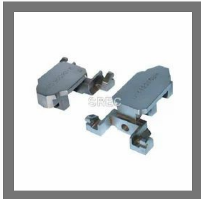
CNC Machined Items