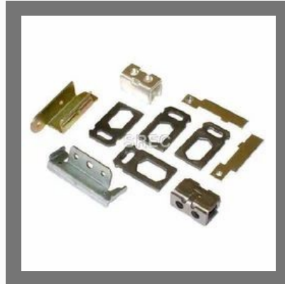
Sheet Metal Item