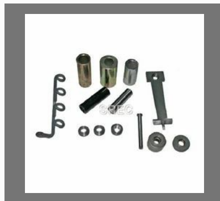
Spacers, Washers, Rollers, Twisted Springs & Piston Pins