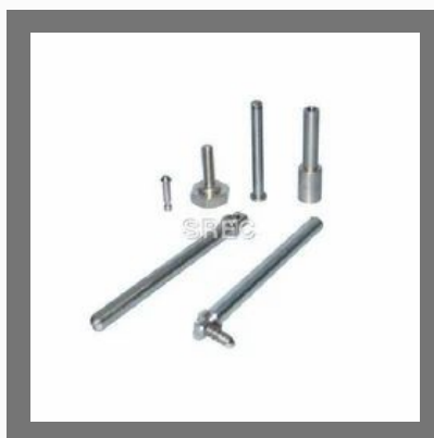
CNC Machined- Components