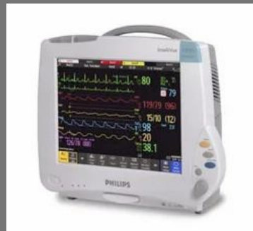
Bedside Patient Monitor