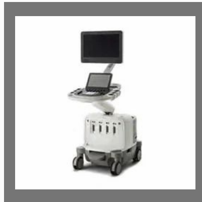
Philips EPIQ 5 Ultrasound Machine