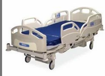
Surgical Hospital Bed