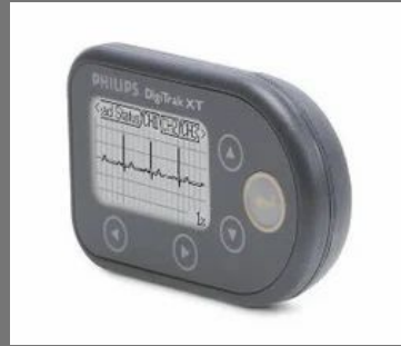
Digitrak XT Holter Recorder