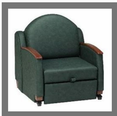
Single Sleeper Chair