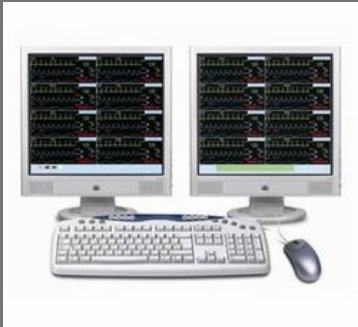
Central Monitoring System