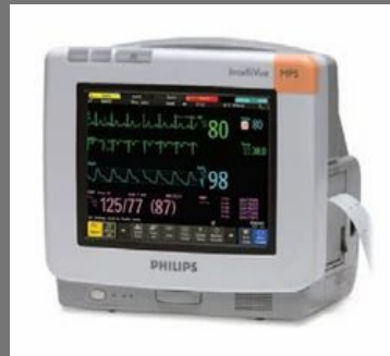
Multi Parameter Monitor