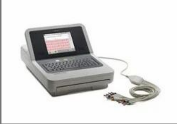
PageWriter TC20 Cardiograph