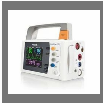
Electric Patient Monitor