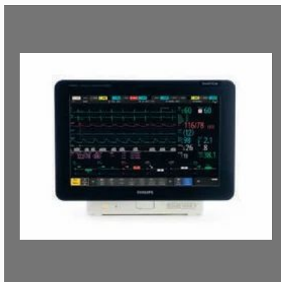
Philips Patient Monitor