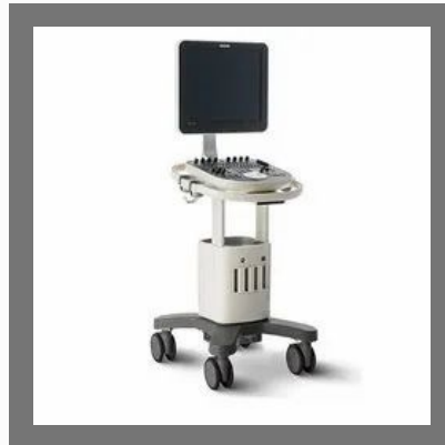
Philips ClearVue 350 Ultrasound Machine