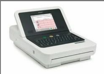
PageWriter TC30 Cardiograph