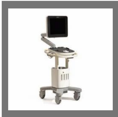
Philips ClearVue 550 Ultrasound Machine