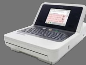
Philips ECG Machine