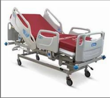
Electric Hospital Bed