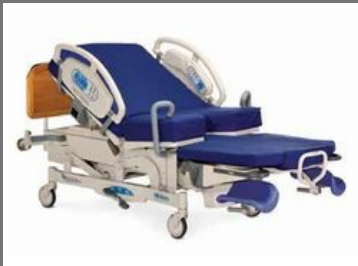
Delivery Hospital Bed