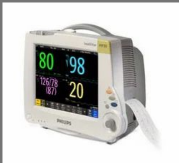
Digital Patient Monitor