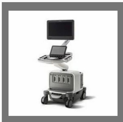
Philips EPIQ 7 Ultrasound Machine