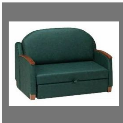
Love Seat Sofa