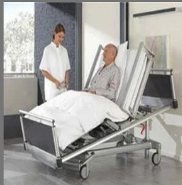
Volker Hospital Bed