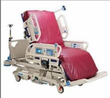
ICU Hospital Bed