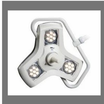
AIM LED Light