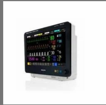
Philips IntelliVue MX600 and MX700