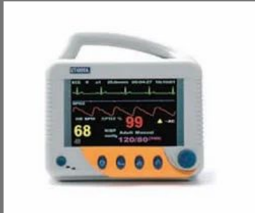
Portable Patient Monitor