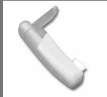
IntelliVue Telemetry System