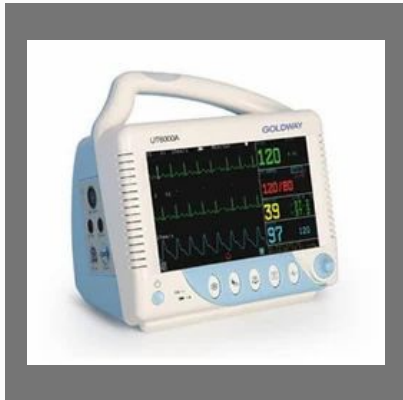
Automatic Patient Monitor