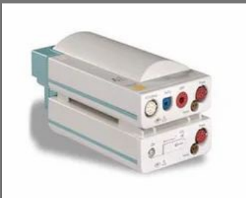
Carbon Dioxide Monitor