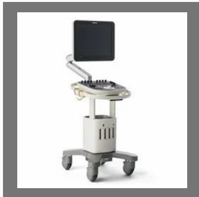
Philips ClearVue 650 Ultrasound Machine