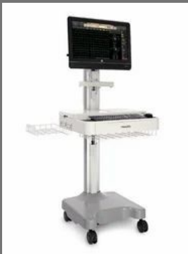
Stress Testing System