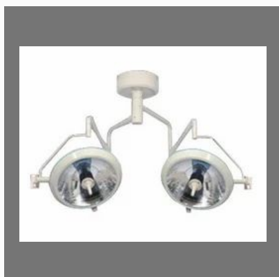
Halogen OT Light