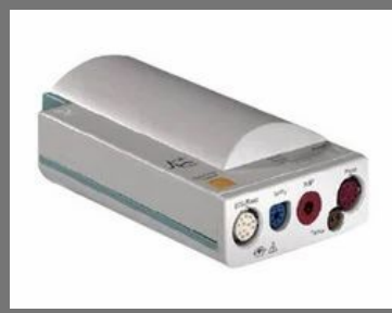
Multi Measurement Server