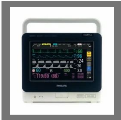
Digital Patient Monitor