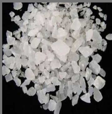
Aluminium Sulphate - Non Ferric Lumps