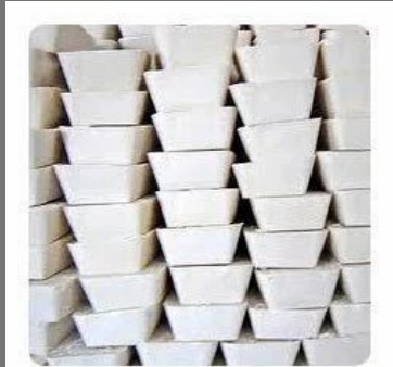
Aluminium Sulphate - Ferric Lumps