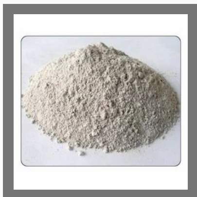
Activated Bleaching Earth