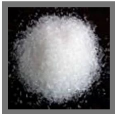
Ortho Phosphoric Acid