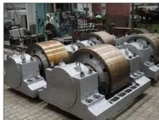
Kiln Support Rollers