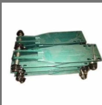
Kiln Spring Plates