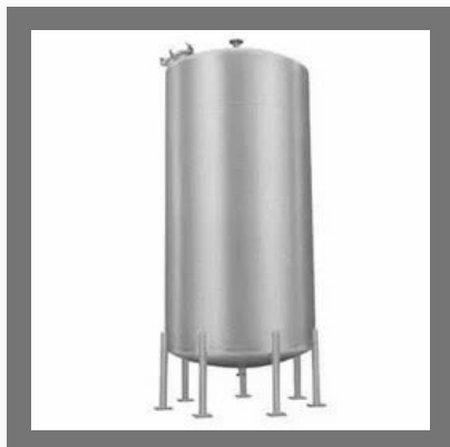
Vertical Storage Tanks