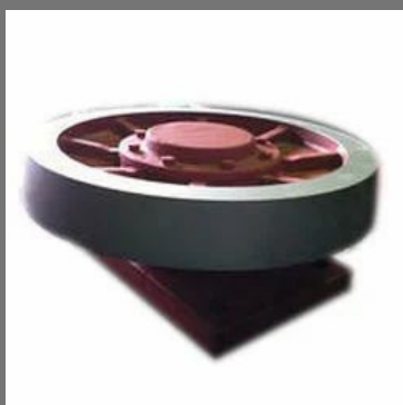
Kiln Thrust Roller