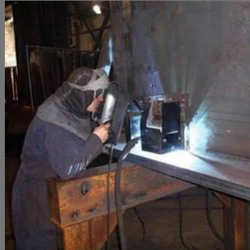
Bridge Girders Fabrication Works