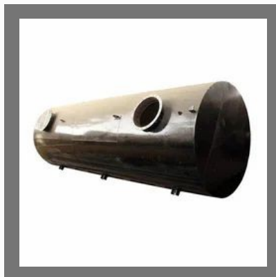
Horizontal Storage Tanks