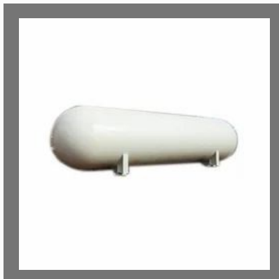
Gas Storage Tanks