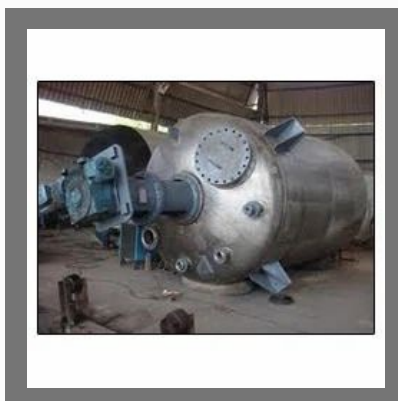
Chemical Process Reactor