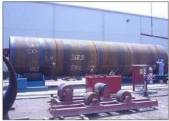
Heavy Pressure Vessel Shell Fabrication Works