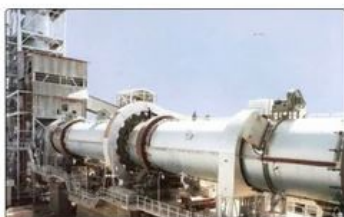
50 TPD Sponge Iron Units