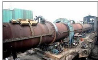
200 TPD Sponge Iron Units