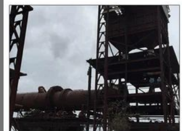
100 TPD Sponge Iron Units