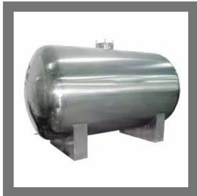
MS Storage Tanks