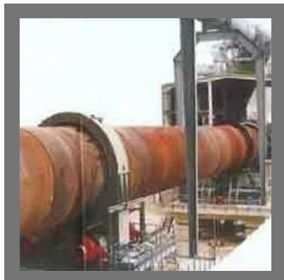
250 TPD Sponge Iron Units