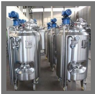
Pharmaceutical Process Reactor