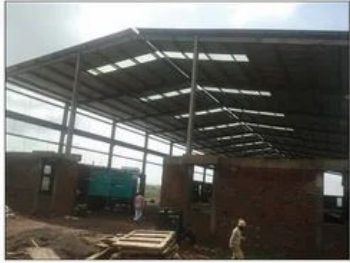
Heavy Industrial Sheds Fabrication Works