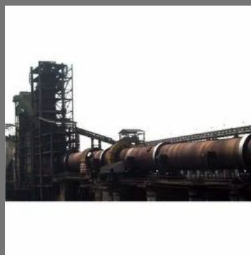
350 TPD Sponge Iron Units