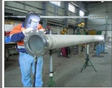
Pipeline Fabrication Works