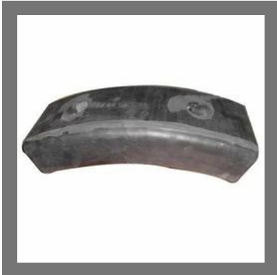
Rubber Curved Pads