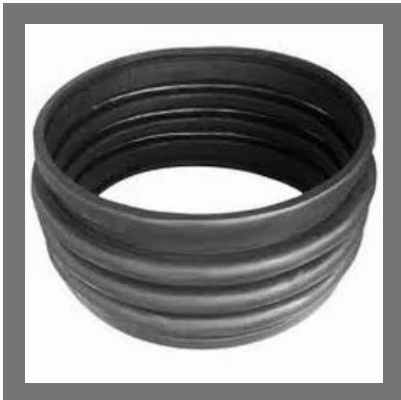
Rubber Lining & Strips