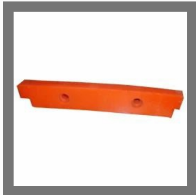
Rubber Sliding Bars