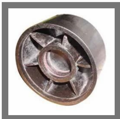
Bakelite Tension Pulleys