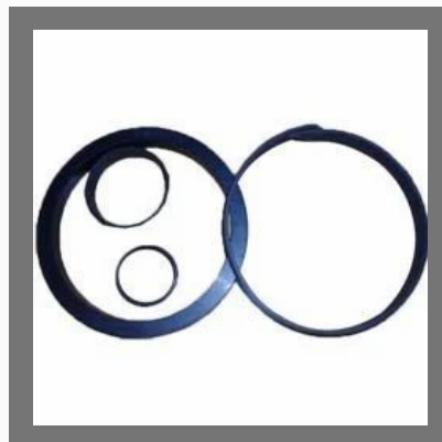
Rubber Seal Kits