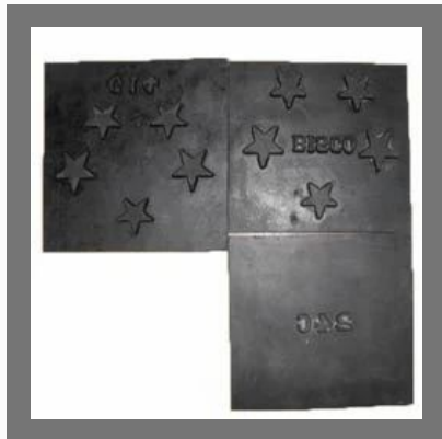
Customized Rubber Logos