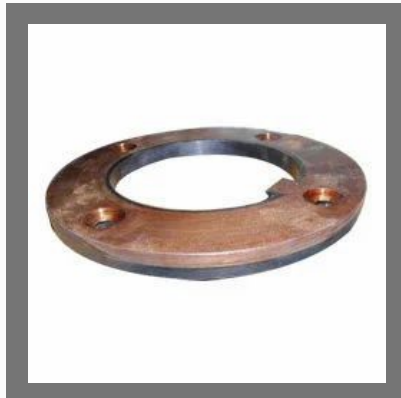
Rubber To Metal Bonding