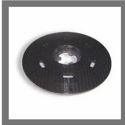
Rubber Pads & Coupling Pads