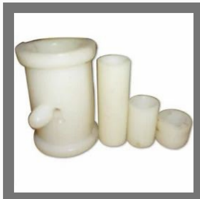
White Nylon Bushes