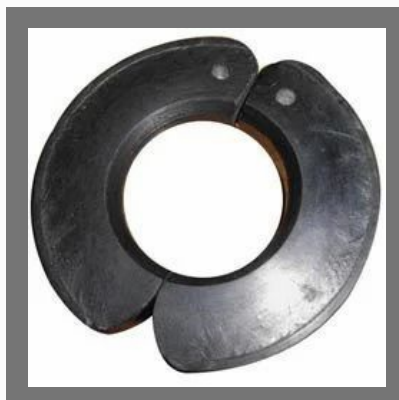
Bakelite Textile Machine Brake Shoes