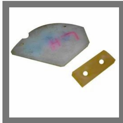
High Pressure Resistant P.U. Packings