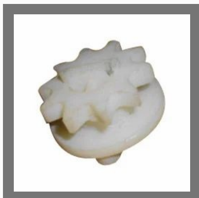
Nylon Catch Sprockets