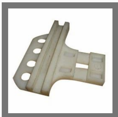
Air Glide Nylon Sledges