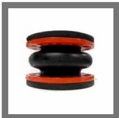
Rubber Expansion Joints