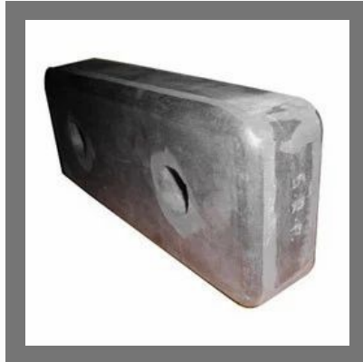
Rubber Straight Pads