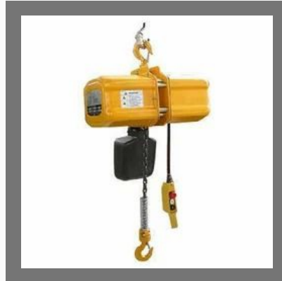
Electric Chain Hoist