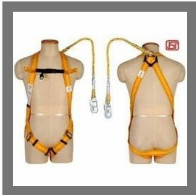
Full Body Harness