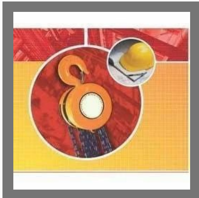
V-Tal Make Chain Pulley Block