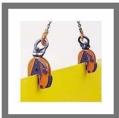
Vertical Plate Lifting Clamp