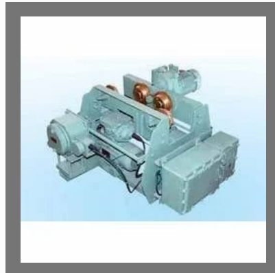
Electric Flame Proof Hoist