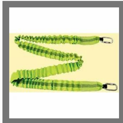
Tow Strap Sling