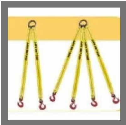
Multi Leg Sling