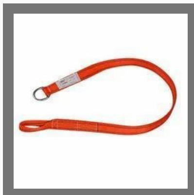
Body Harness Extension Attachment