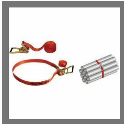
Ratchet Endless Lashing