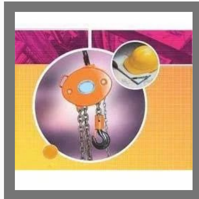
Chain Pulley Block