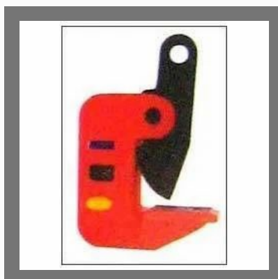
Horizontal Plate Lifting Clamp