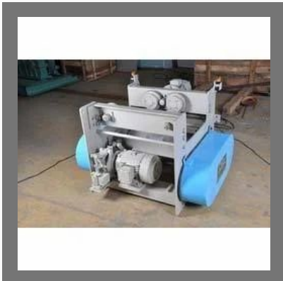
Electric Wire Rope Hoist