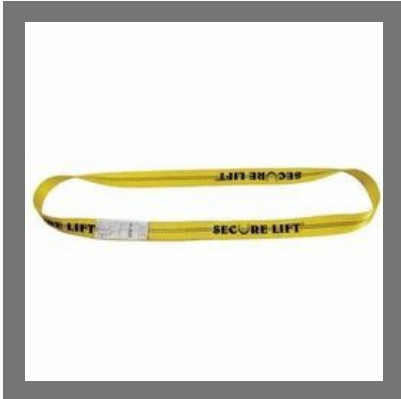
Flat Endless Webbing Sling