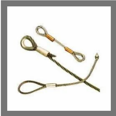
Wire Rope Sling