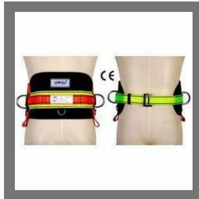
Work Positioning Belt