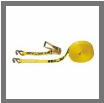
Cargo Lashing Belt