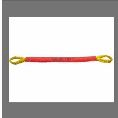
Round Sling With Eye Loop