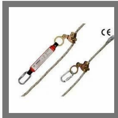
Rope Grab Fall Arrester