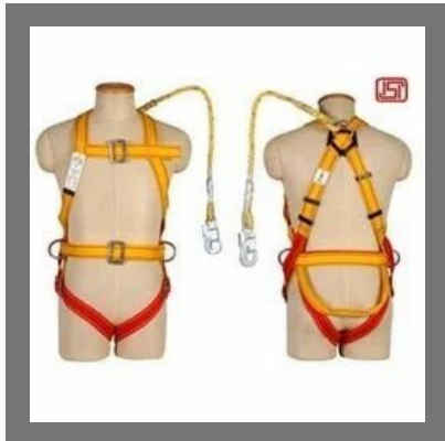
Full Body Harness