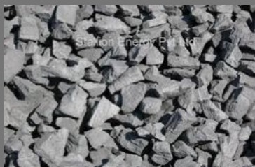
Low Ash Met Coke