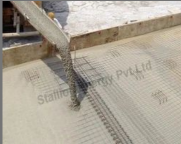
Ready Mix Concrete