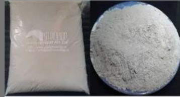
Ground Granulated Blast Furnace Slag (GGBFS)