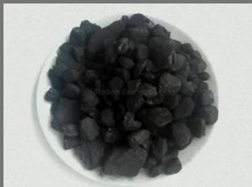
South African Steam Coal