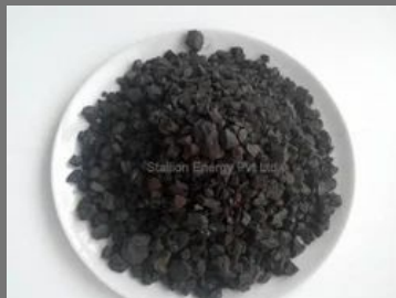
Indonesian Steam Coal