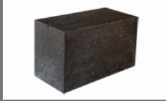
Light Weight Blocks