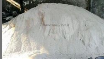
Granulated Blast Furnace Slag (GBFS)