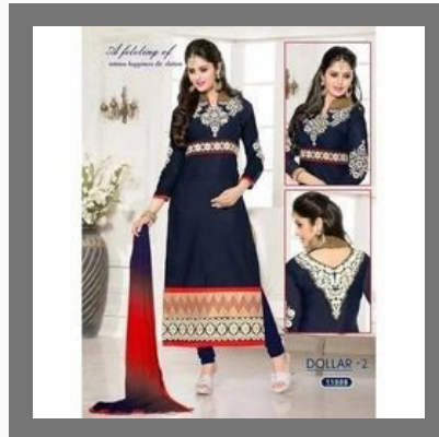
Black Embroidery Suit