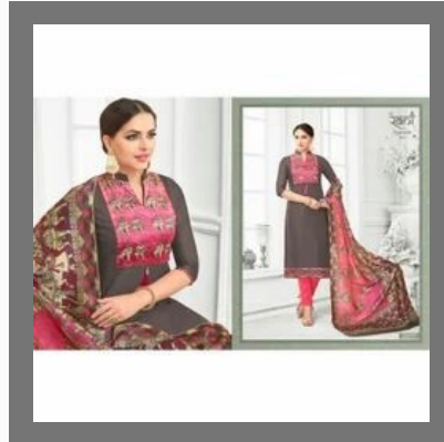
Patiala Cotton Suits