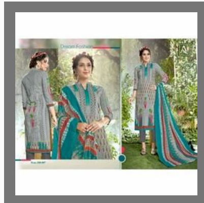
Embroidered Cotton Suits