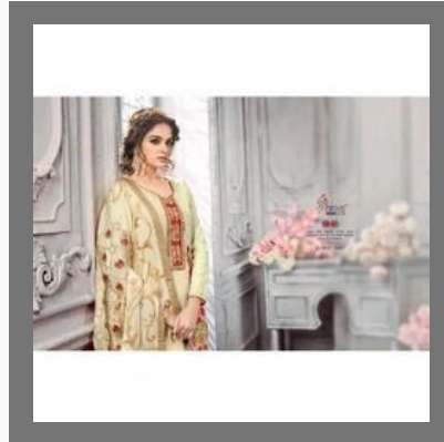
Designer Salwar Suit