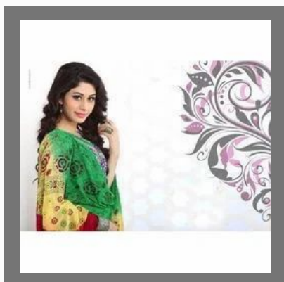
Ladies Embroidery Suit