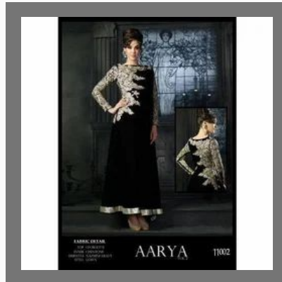
Designer ladies suits Ladies Suit