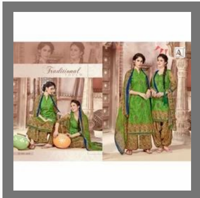
Designer Ladies Suit