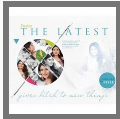
Straight Cut Georgette Suit