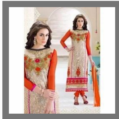
Designer Ladies Suit