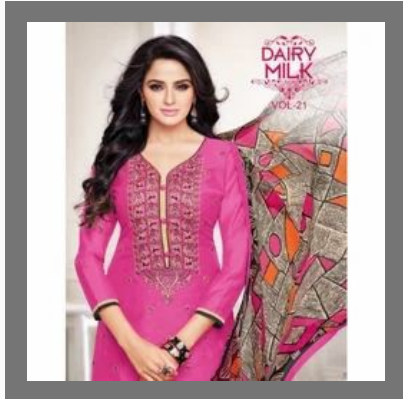
Ladies Designer Suits