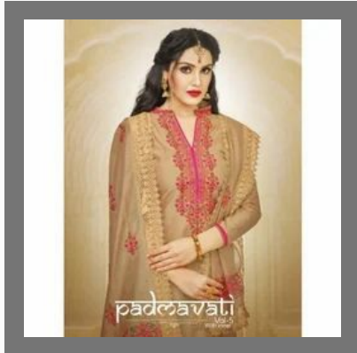
Heavy Georgette Suits