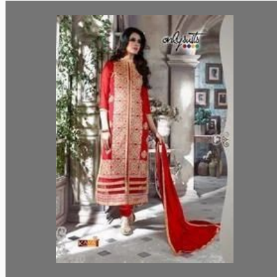
Karachi Style Suit