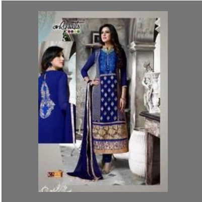
Pakistani Ladies Salwar Kameez