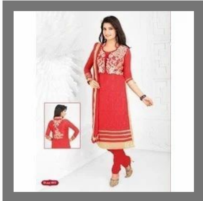
Stylish Catalog Ladies Suit