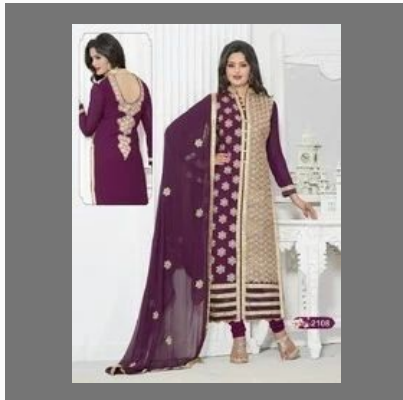
Trendy Ladies Suit