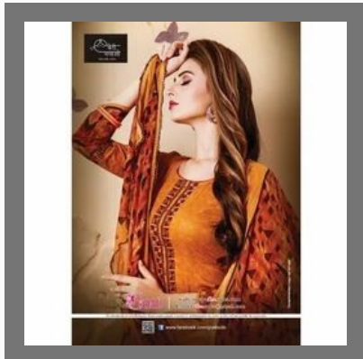
Cotton Embroidered Suits