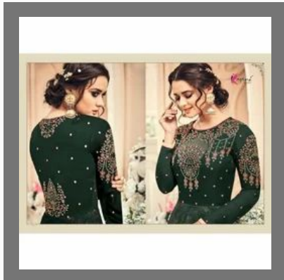
Heavy Georgette Suits