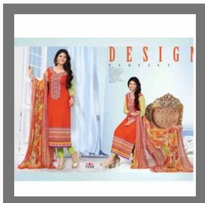
Designer Cotton Suits