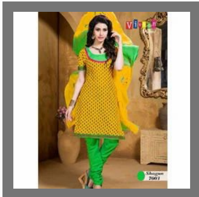
Cotton Designer Suits