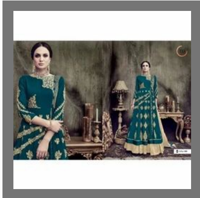
Straight Designer Suit