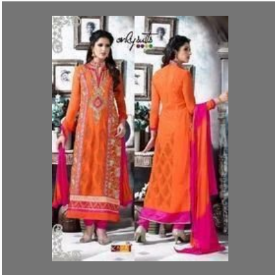
Pakistani Ladies Suit