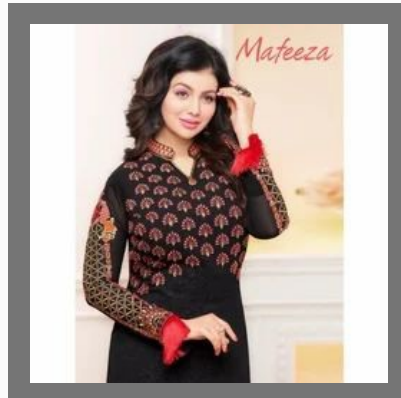
Designer Ladies Suit