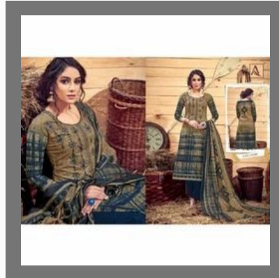
Cotton Designer Suits