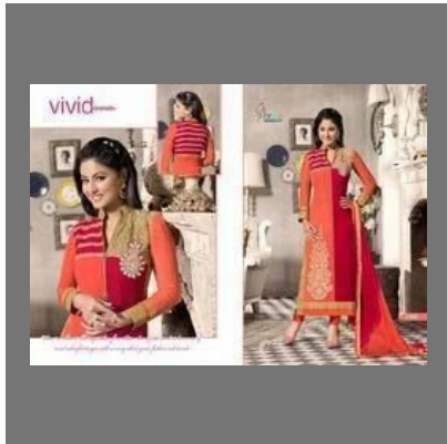
Bollywood Ladies Suit