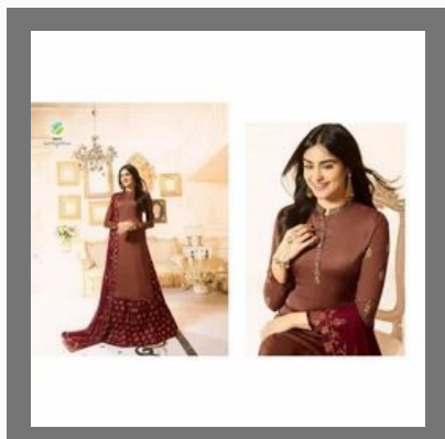
Georgette Embroidered Suits