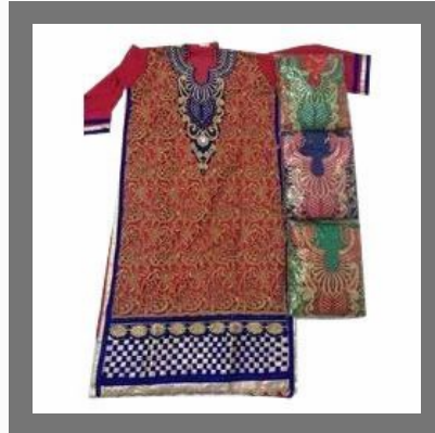
Georgette Embroidery Suit