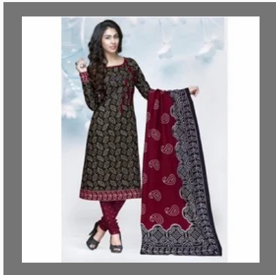
Cotton Dress Materials