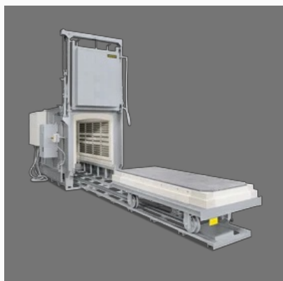
Bogie Hearth Furnace