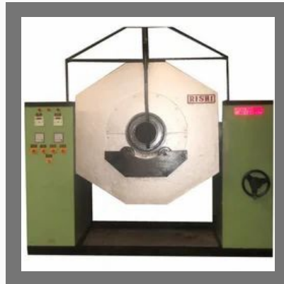
Electric Rotary Retort Furnaces