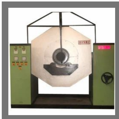
Oil and Gas Furnace