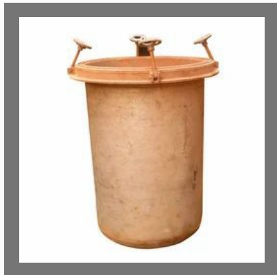
Vertical Furnace Pot