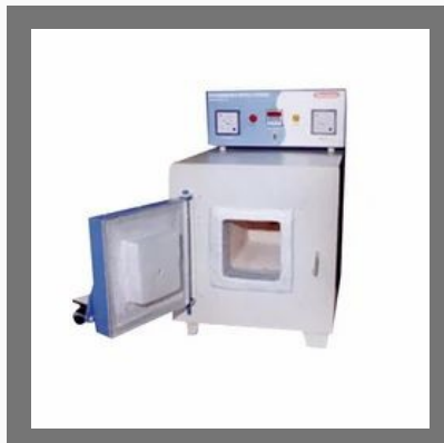
Box Type Muffle Furnace