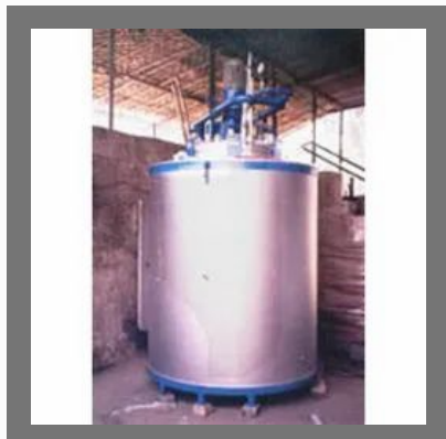
Gas Carborizing Furnace