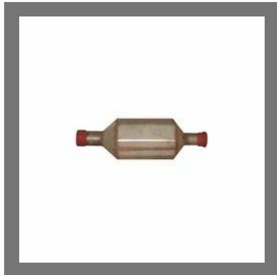
Retort for Rotary Furnace