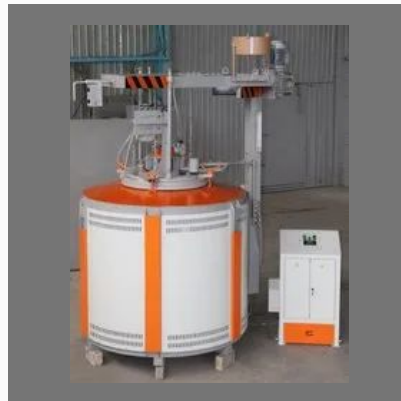
Gas Carburising Furnace ( Electrical)