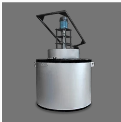
Pit Tempering Electric Furnace