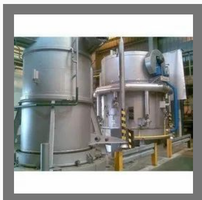
Bell Type Annealing Furnace