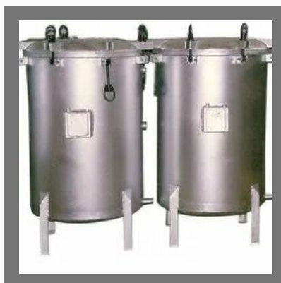
Stainless Steel Retort