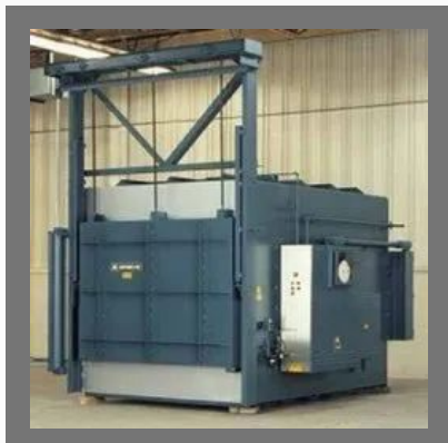
Box Type Furnace