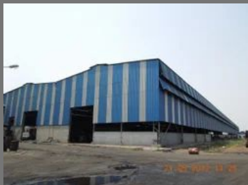
Structural Glazing Turnkey Projects