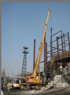
Civil Construction Consultancy