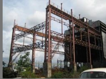
Heavy Industrial Structures