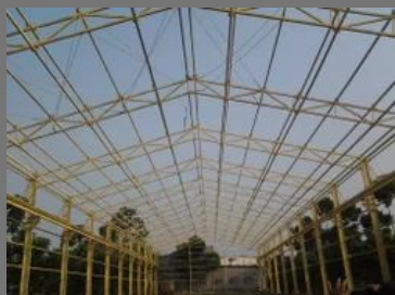
Prefabricated Industrial Structures