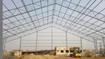
Architectural Designing Services