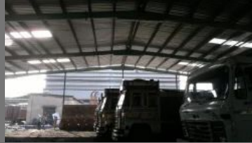
Car Parking Sheds