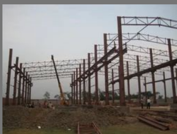
Industrial Construction Projects