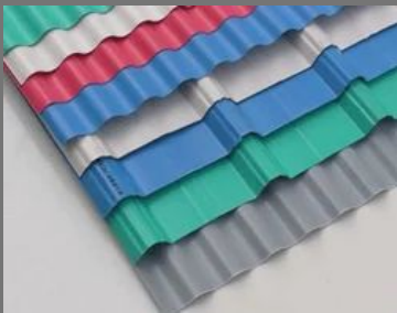
Metal Roofing Sheets