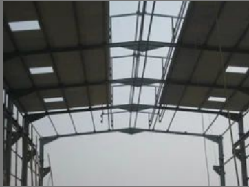
Steel Structure Works