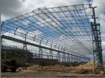
Pre Fabricated Steel Structures