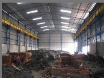
Civil Works Services