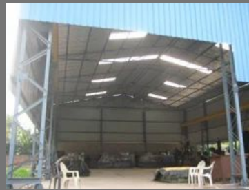
Steel Roofing Sheet Fabrication