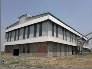
Fiberglass Sheet Sheds