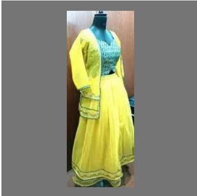
Ladies Designer Palazzo Suit