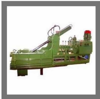
Triple Compression Scrap Baling Press