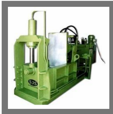
Double Compression Scrap Baling Press