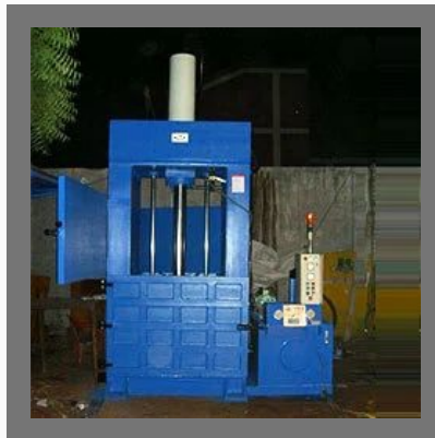
Paper Baling Press