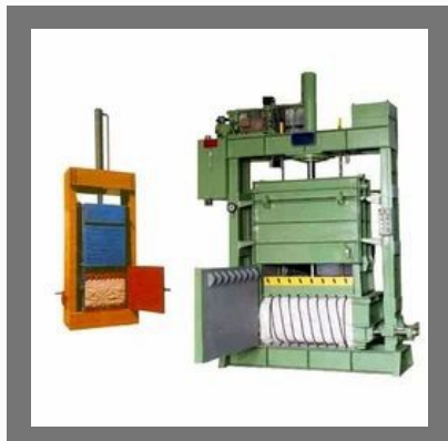
Cotton Baling Press