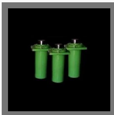
Single And Double Action Hydraulic Cylinder