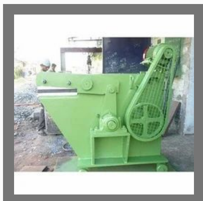
Iron Scrap Cutting Machine