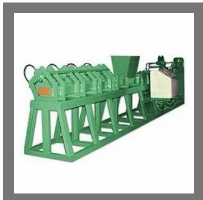
Coir Pith Briquette Machine