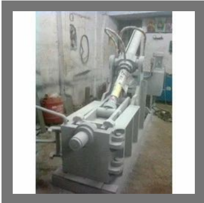
Double Press Manual Front Ejection