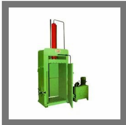
Plastic Baling Press