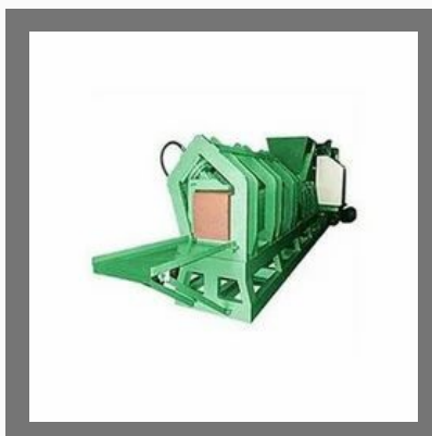
Coir Pith Block Making Machine