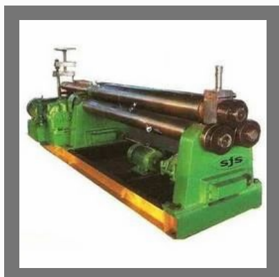
Sheet Rolling Machines