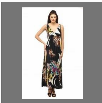
Fancy Ladies Gown