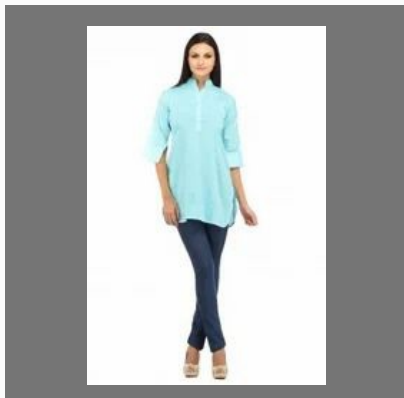
Stylish Ladies Top