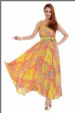
Printed Ladies Gown