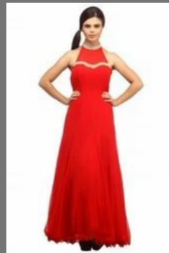
Fancy Red Long Gown