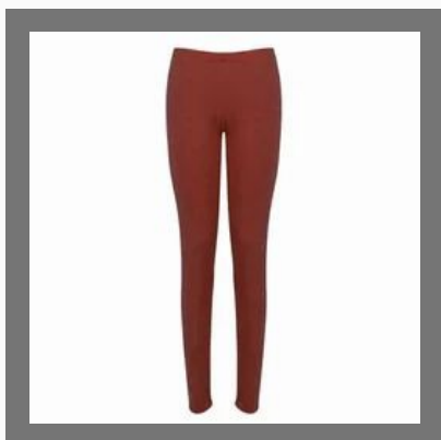
Ladies Brown Legging