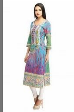
Fancy Ladies Cotton Kurti