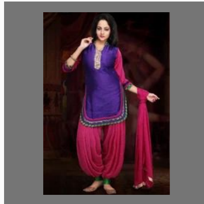
Ladies Patiala Suits