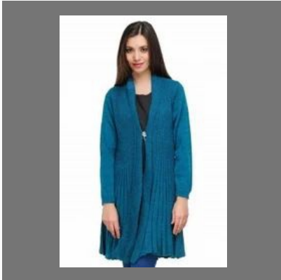
Woollen Blue Shrug