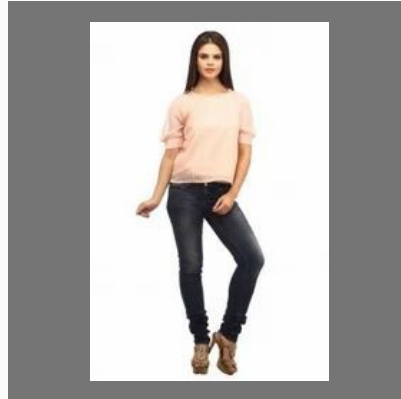
Stylish Ladies Top