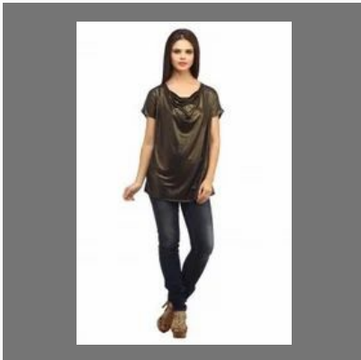
Fancy Ladies Top