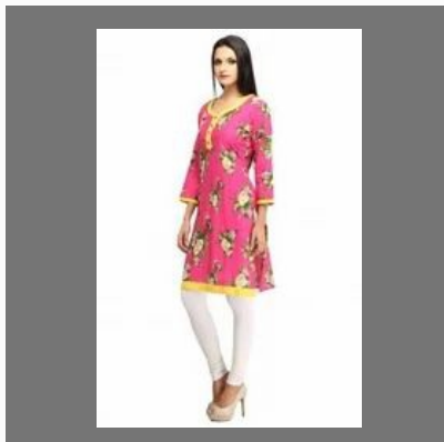
Printed Ladies Cotton Kurti