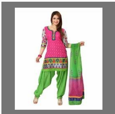
Designer Ladies Suit