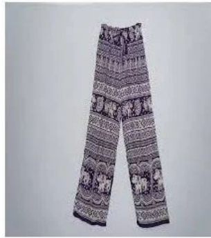
Printed Ladies Palazzo