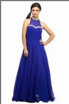
Fancy Blue Ladies Gown