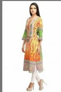
Printed Ladies Cotton Kurti