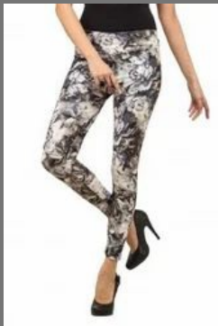
Printed Ladies Legging