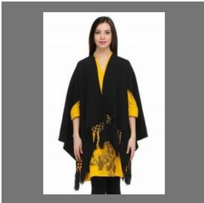
Woolen Black Capes