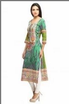
Designer Ladies Cotton kurti