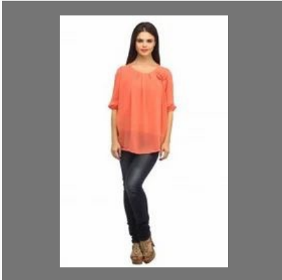
Designer Ladies Top