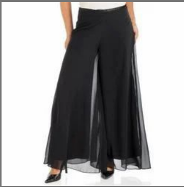
Black Ladies Palazzo