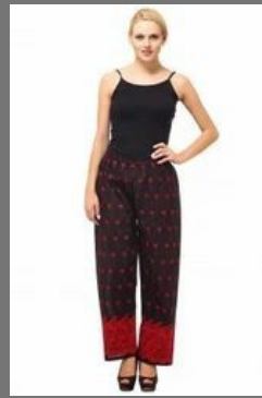
Ladies Stright Fit Palazzo Pants