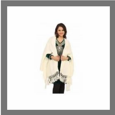
Woolen White Capes