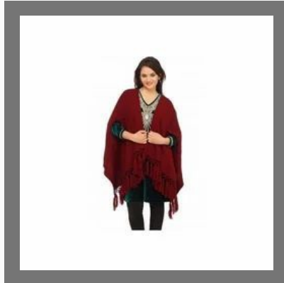
Woolen Maroon Capes