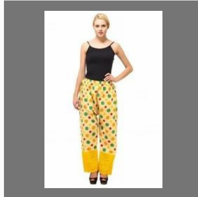
Ladies Straight Fit Palazzo Pants