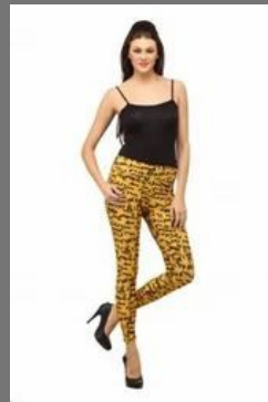
Fancy Ladies Legging