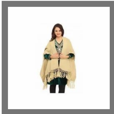
Woolen Camel Capes