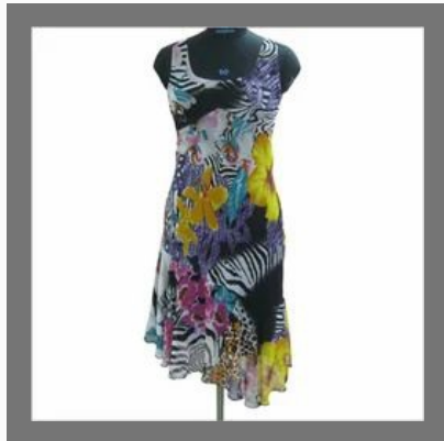
Ladies Western Wear