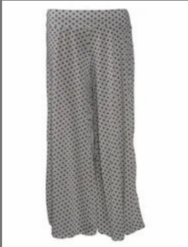
Fancy Ladies Palazzo