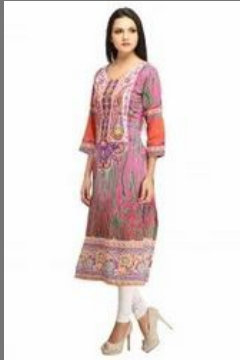
Stylish Ladies Cotton Kurti