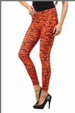
Stylish Ladies Legging