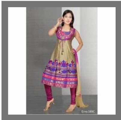
Ladies Anarkali Suit