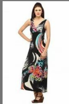
Stylish Ladies Gown