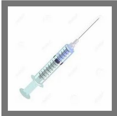
Hepatitis-B Injection Adult