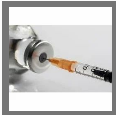
Anti-Snake Venom Serum Injection