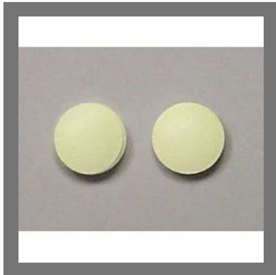
Chlor Mal Tablet