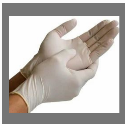
Latex Examination Glove