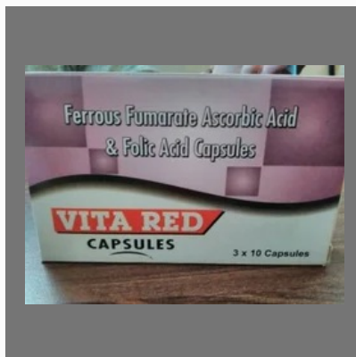
Vita Red Capsule