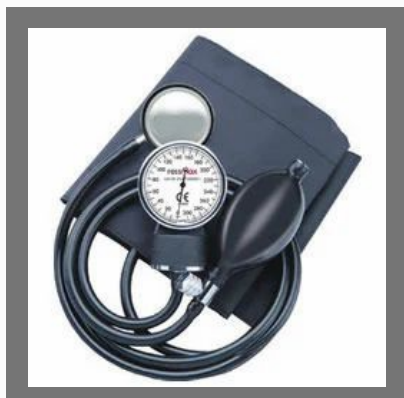
BP Machine Manual