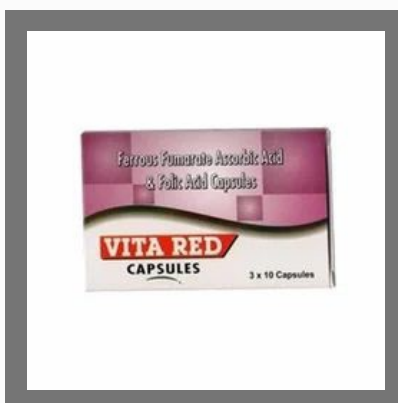
Ferrous Fumarate Ascorbic Acid And Folic Acid Capsules