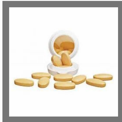
Vitamin C Chewable Tablet