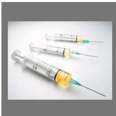
Rabies Vaccines Injection