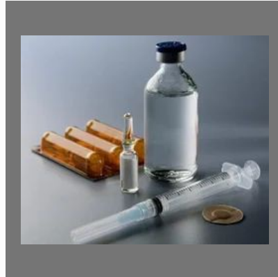
Hepatitis-B Injection Multi