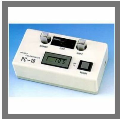
Photo Electric Colorimeter