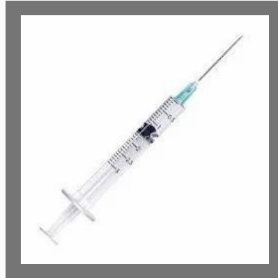
Syringe And Needle Vector