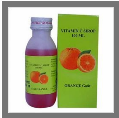
Vitamin C Syrup