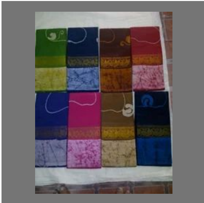
Sungudi Cotton Sarees(Kanji Cotton)