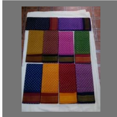
Sungudi Cotton Sarees(Kanji Cotton)