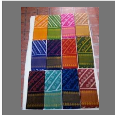
Sungudi Cotton Sarees(Kanji Cotton)