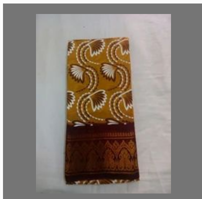
Sungudi Cotton Sarees(kanji Cotton)