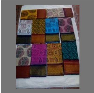
Sungudi Cotton Sarees(kanji Cotton)