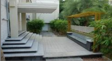
Consturction Of Stone Work