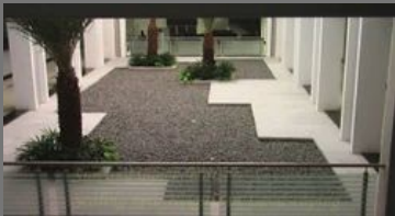
Consturction Of Stone Work