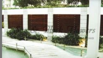
Consturction Of Wood Work