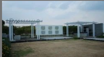
Consturction Of Stone Work