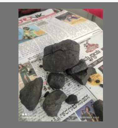
Imported Coal For Industry