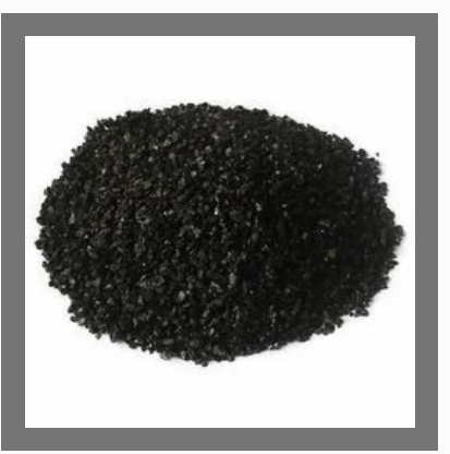
Carbon Steam Coal