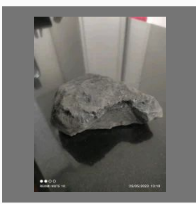
Imported Steam Coal