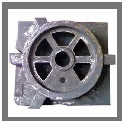
Rotary Table CI Castings