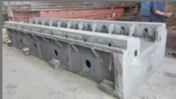
Plano Miller Base Castings