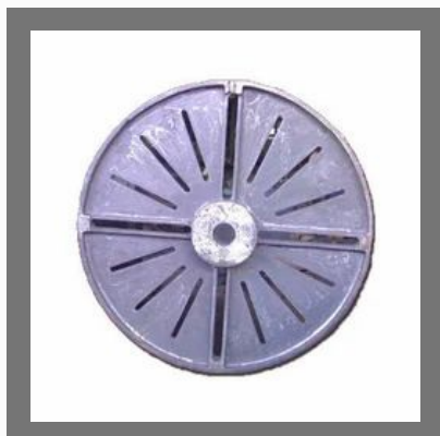
Face Plate Castings