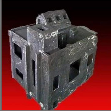
CNC Machine Bed Castings