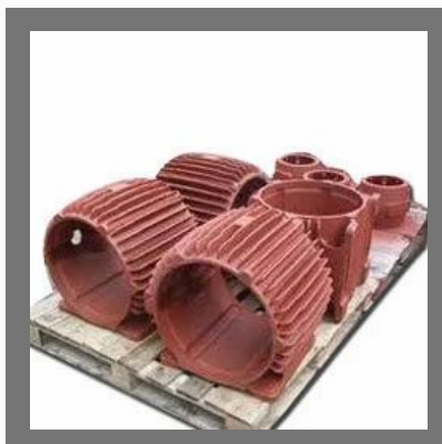
Motor Body & Cover Castings