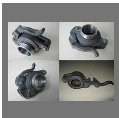
SG Iron Castings