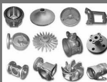
Stainless Steel Casting