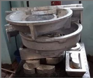
Aluminium Sand Castings