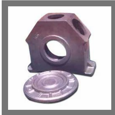
Housing Covers Castings