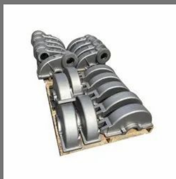
Aluminum Alloy Casting