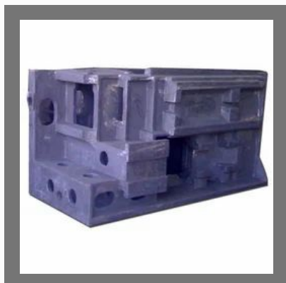
Bed & Base Castings