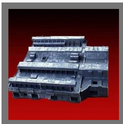
Machine Base Castings