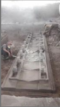
Table Machine Tool Castings