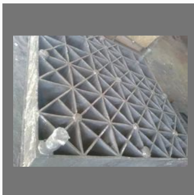
Surface Plate Castings