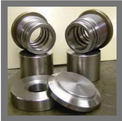
Hydraulic Components CI Castings