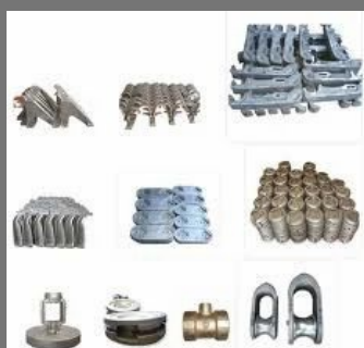
Alloy Steel Casting