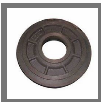
Alloy Steel Casting