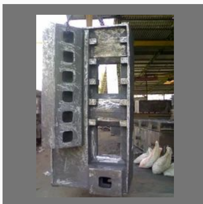
CNC Bed Castings