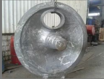
Machine Tool Castings