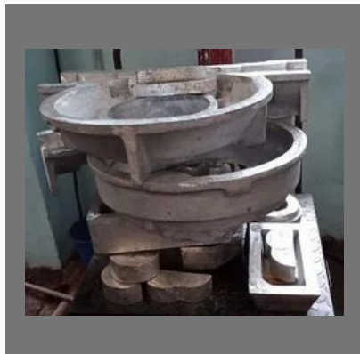
Aluminium Die Casting Parts