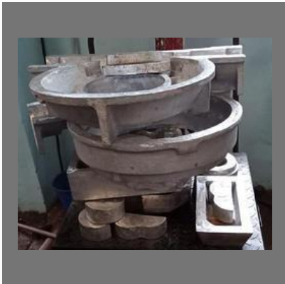
Aluminum Casting Mold