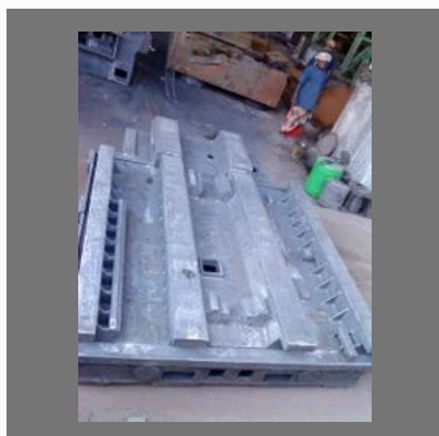
Bed Castings 2 Ton Wt