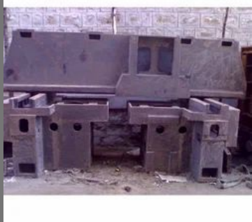
Cylindrical Grinding Machine Bed Castings