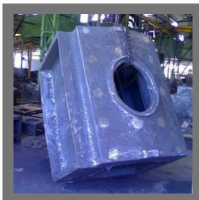
Single Piece Column Castings