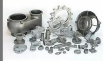
Carbon Steel Casting