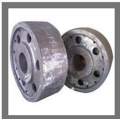
Alloy Iron Castings