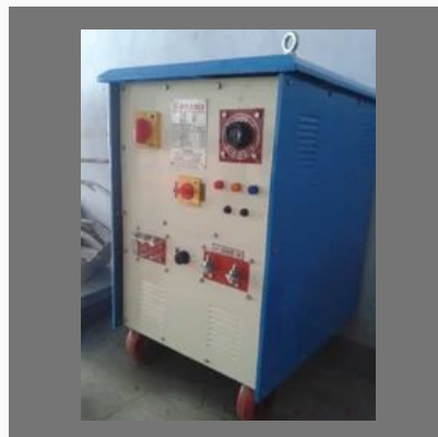
ARC Welding Rectifiers Machine