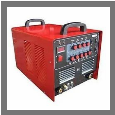
AC Aluminum Welding Machine