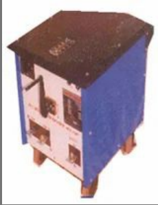
AC ARC Welding Transformers