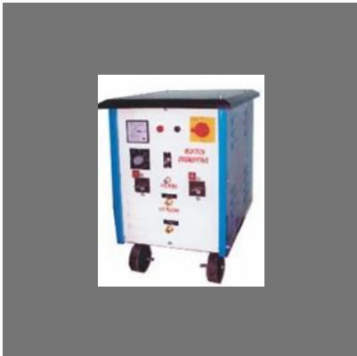
Crux Cutair Plasma Welding Equipments