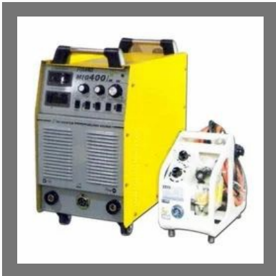
MIG Welding Machine