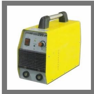
Inverter Based Welding Machines