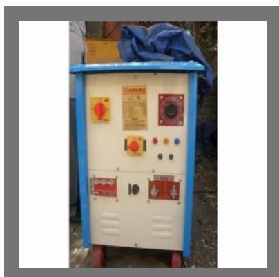
ARC Welding Rectifier