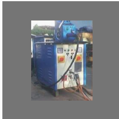
CO2 MIG Welding Machine