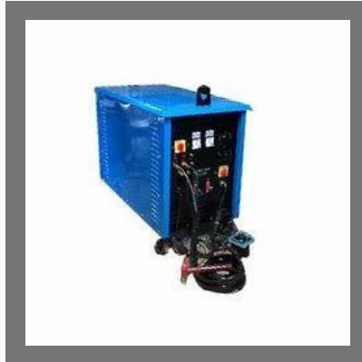
Plasma ARC Cutting Machine