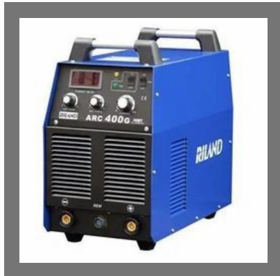
Invertor Base MMA ARC 400amp 3 Phase