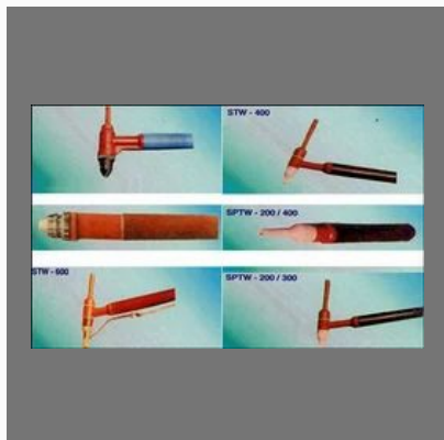
All Type Of Welding Torch