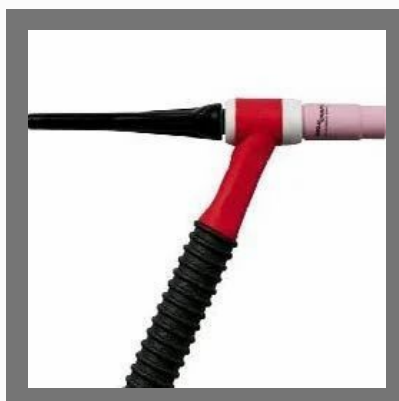
TIG Welding Water Cooled Torches