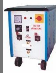
DC ARC Welding Power Saver