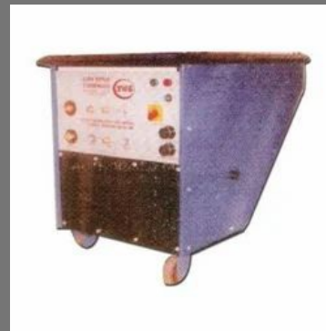
CUM Tig Welding With Water Cooling System