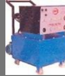
DC TIG Welding High Frequency Unit