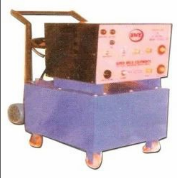
DC TIG Welding Machine