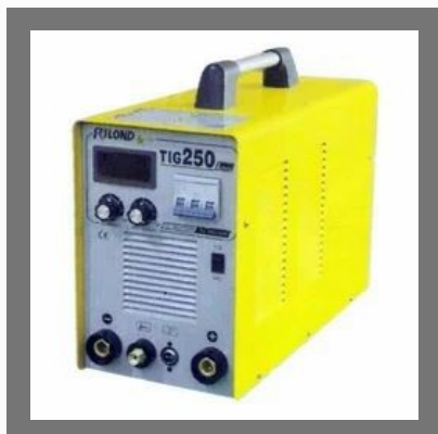
Inverter Based Welding Machines