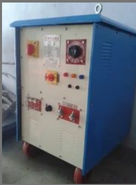
Arc Welding Machine