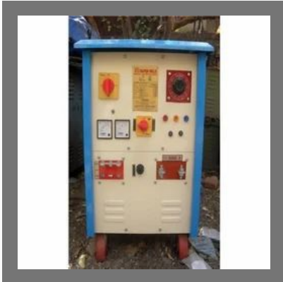
ARC Welding Rectifier