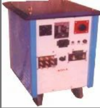
DC ARC Welding Rectifiers