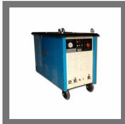
Air Plasma Cutting Machine