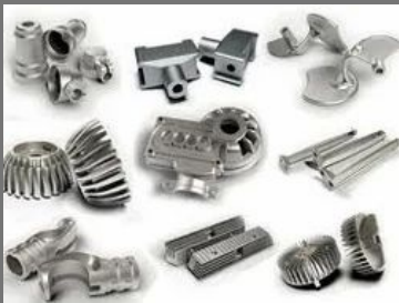
Aluminium Precision Casting