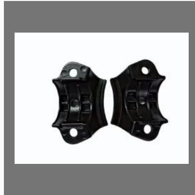
Aluminium Pressure Die Casting