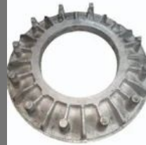
Aluminium Sand Casting