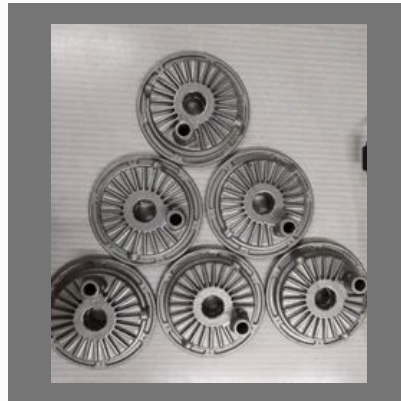
Investment Cast Parts