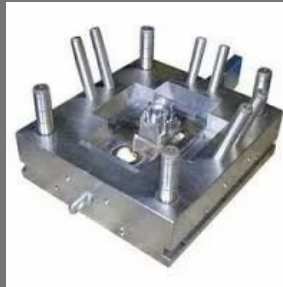
Pressure Die Casting