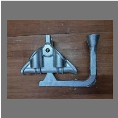
Aluminium Gravity Die Castings