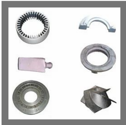
Gravity Die Castings