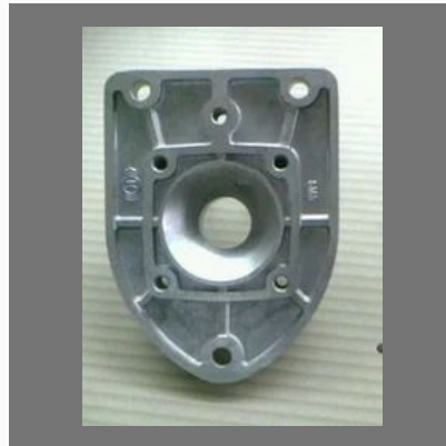
Gravity Die Castings