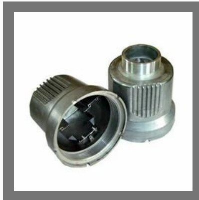
Aluminium Sand Castings