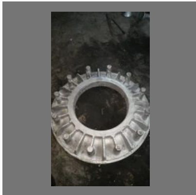
Aluminium Sand Casting