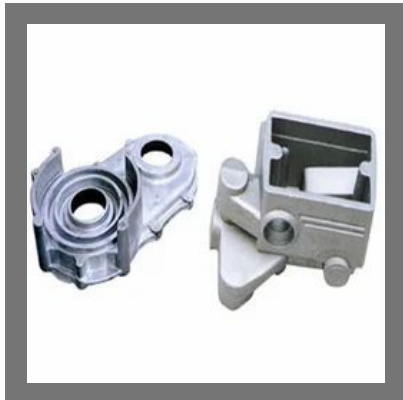
Aluminium Gravity Casting Parts