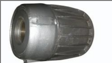
Aluminium Die Castings