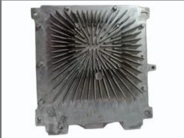
Aluminum Die Casting