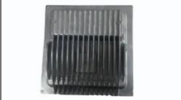
Aluminium Pressure Die Casting