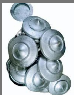
Aluminium Sand Casting