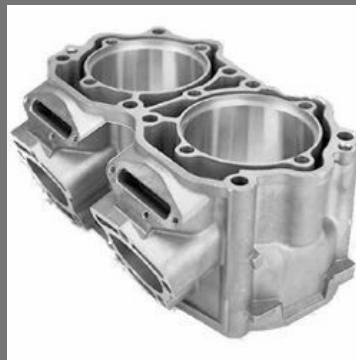
Pressure Die Castings