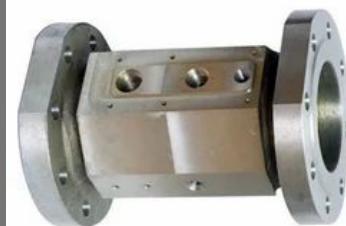
Machined Aluminium Castings