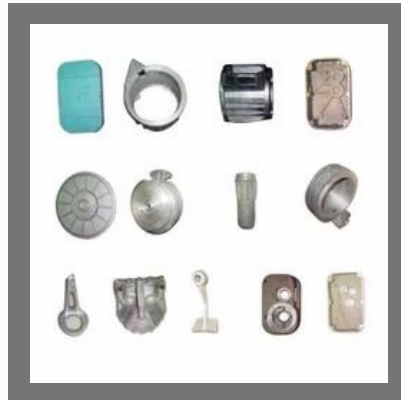
Aluminium Gravity Die Castings