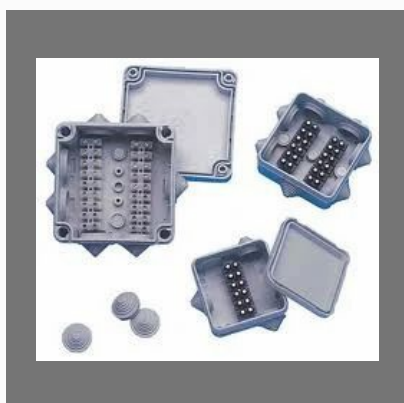
Aluminium Rectangular Junction Boxes