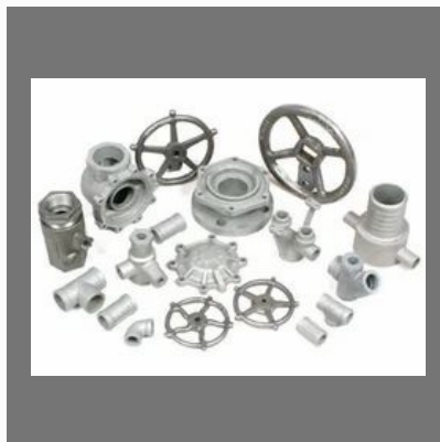
Aluminium Valve Casting