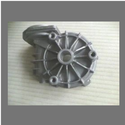
Pressure Die Castings