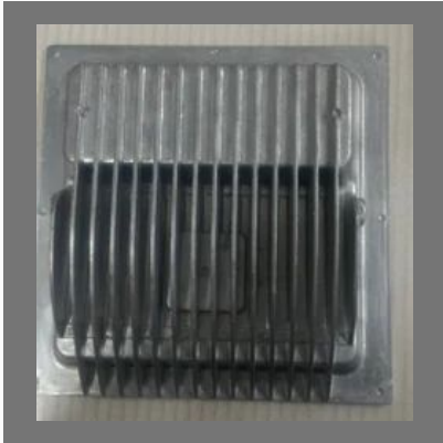
Aluminum Pressure Die Casting