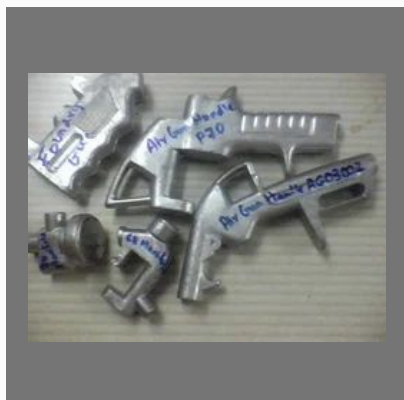
Spray Gun Handle Casting