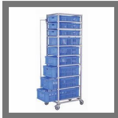
Vegetable Storage Rack