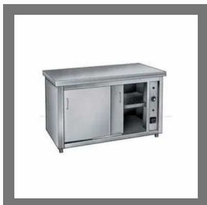
Hot Case Service Counter