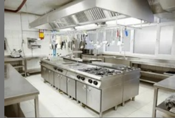
Restaurant Kitchen Equipments