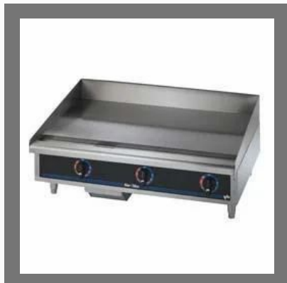
Griddle Top/Dosa Plate