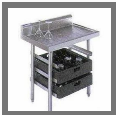
Dish Table With Glass Racks