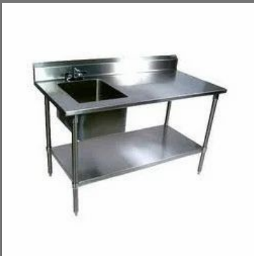
Preparation Table Sink Under Shelf