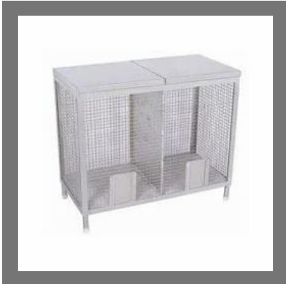
Onion Potato Bin