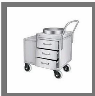
Tea Service Trolley