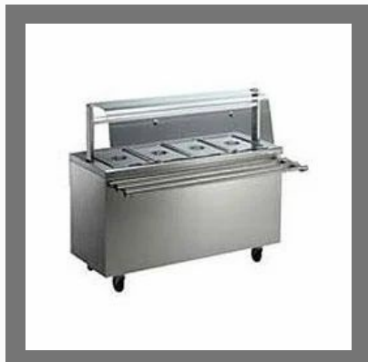
Hot Food Service Counter