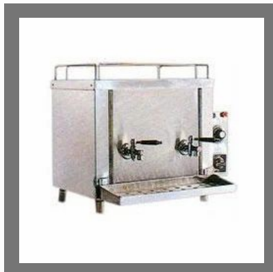
Tea Milk Dispenser