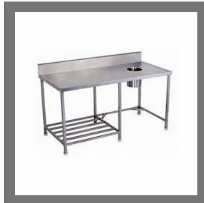
Soiled Dish Landing Table