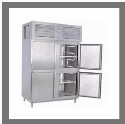
Four Door Refrigerators