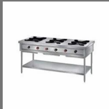
Gas Cooking Range