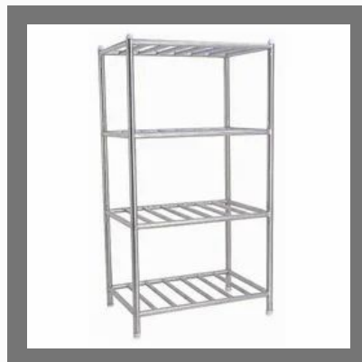
SS Pot Rack