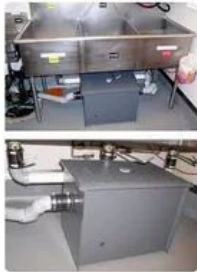
Oil Grease Trap