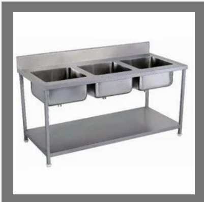
Three Sink Dish Wash Unit