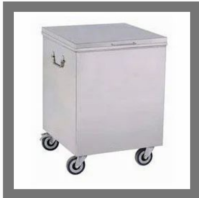
Mobile Ingredient Bin