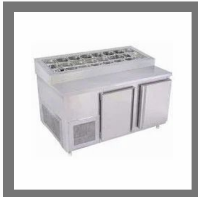
Pizza Counter Refrigerator