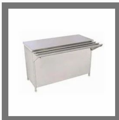
Pick UP Counter With Tray Slide