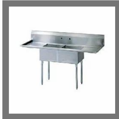
Two Sink Unit