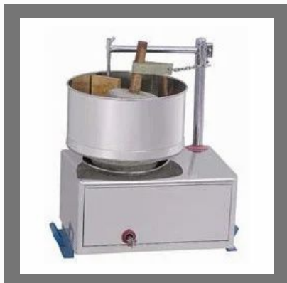
Wet Masala Grinder