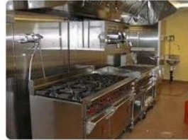
Hotel Kitchen Equipment