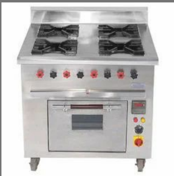
Continental Gas Cooking