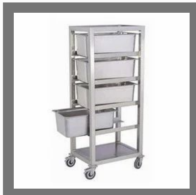
G. N. Pan Trolley