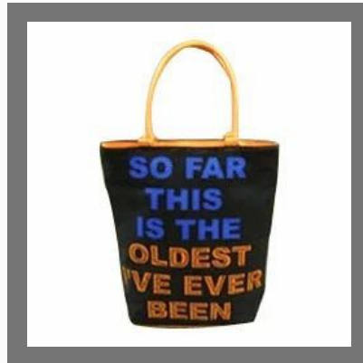
Designer Shopping Bags