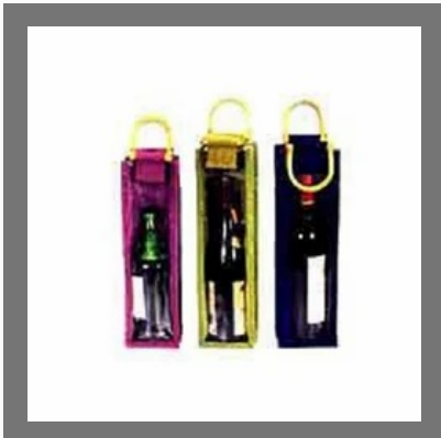
Wine Bottle Bags