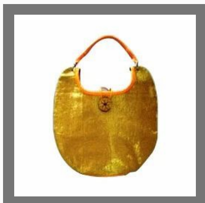
Ladies Fashion Bags