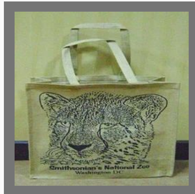
Animal Print Designer Bags