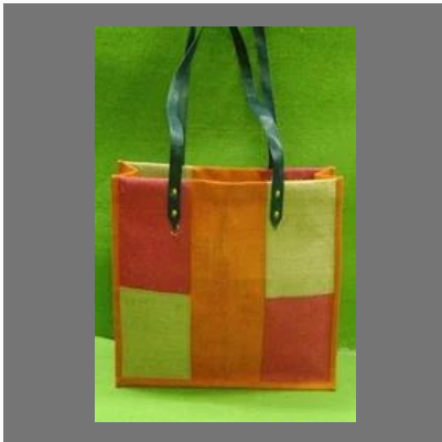
Fashion Clutch Bags