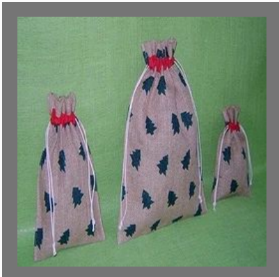
Fashionable Beach Bag