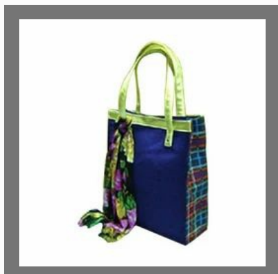
Ladies Jute Fashion Bags