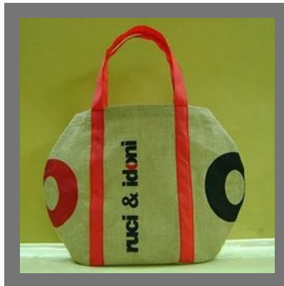
Cotton Promotional Bags