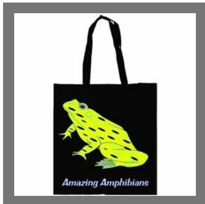
Printed Promotional Bags