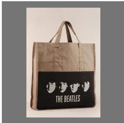
Cotton Promotional Bags