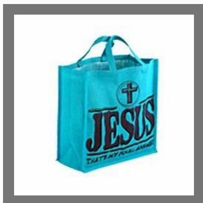
Fancy Jute Promotional Bags