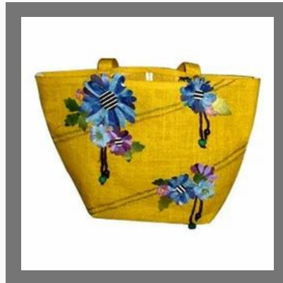
Floral Fashion Bags