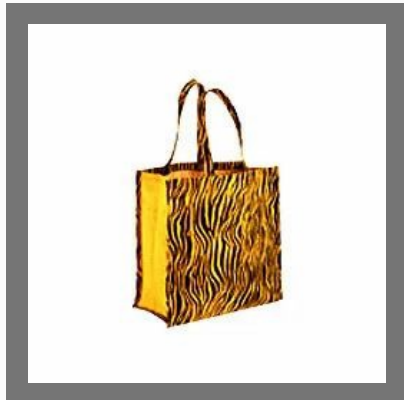
Zebra Print Bags