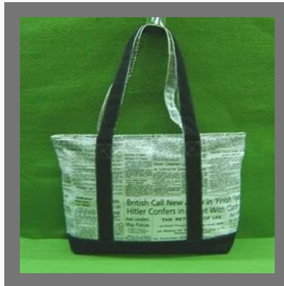
Cotton Promotional Bags