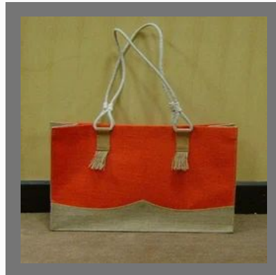
Jute Shopping Bags