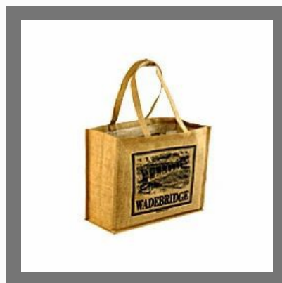
Webbing Handle Promotional Bags