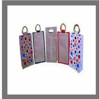
Colored Bottle Bags