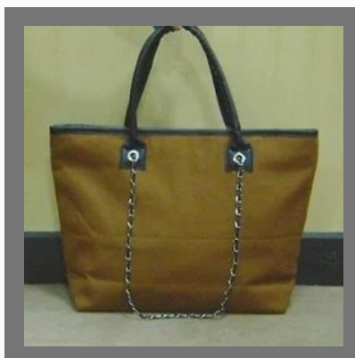
Fashion Cotton Bags