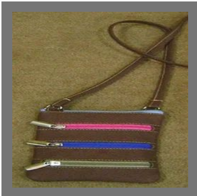
Colorful Designer Bags