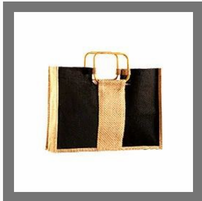
Shopping Handle Bags