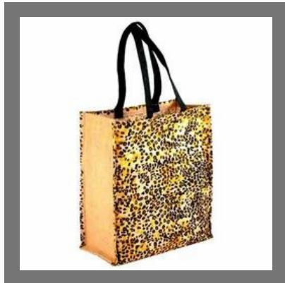
Jute Animal Print Bags