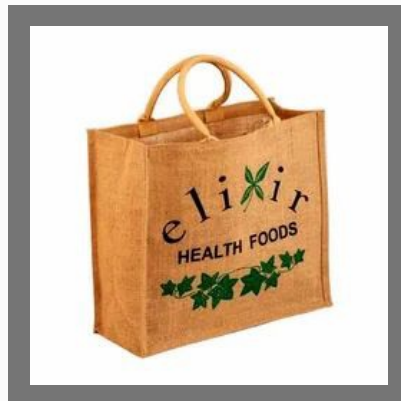
Jute Promotional Bag