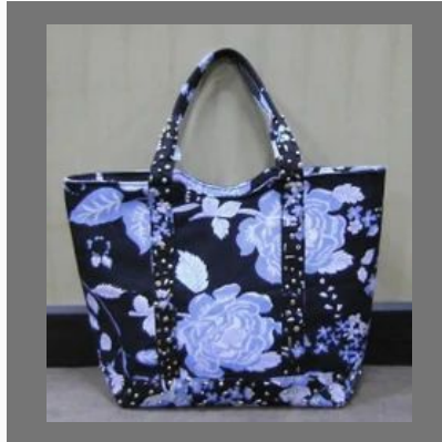
Printed Canvas Bags