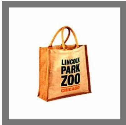
Eco Friendly Promotional Bags