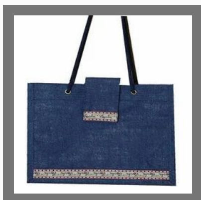
Ladies Designer Bags