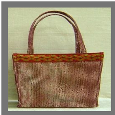
Canvas Fashion Bags