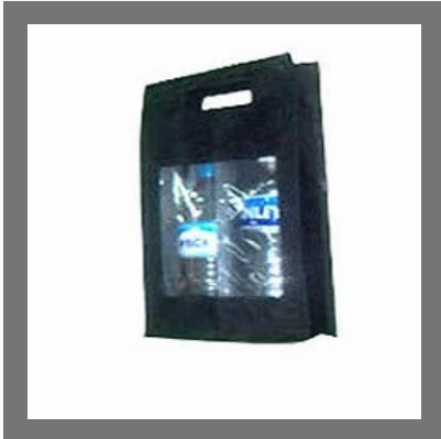
Jute Bottle Bags