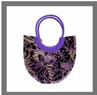
Trendy Fashion Bags