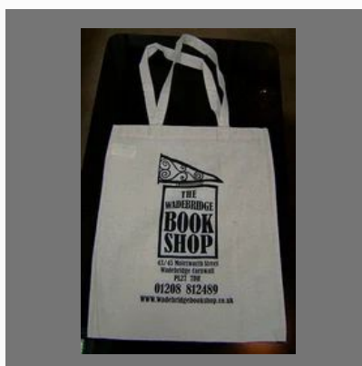
Designer Promotional Bags