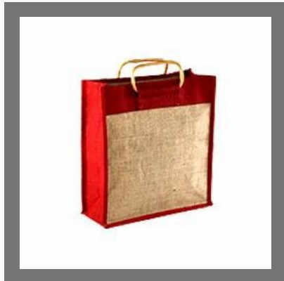
Knitted Shopping Bags