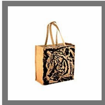
Tiger Print Bags