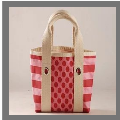
Colorful Designer Bags