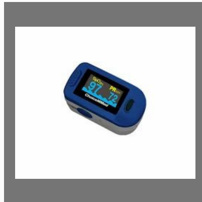
Choicemmed Fingertip Pulse Oximeter