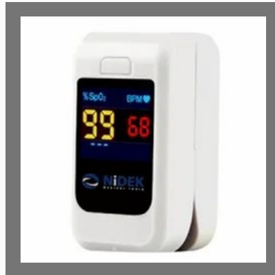
Nidek Finger Tip Pulse Oximeter