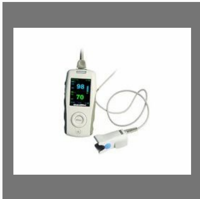
Choicemmed Hand Held Pulse Oximeter