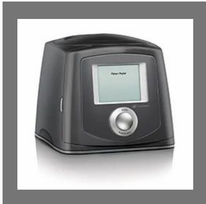
Fisher & Paykel Icon Auto Plus