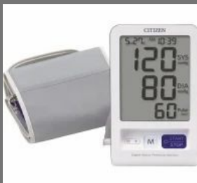
Upper Arm Citizen Digital Blood Pressure Monitor