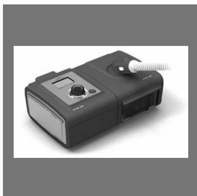
Philips Respironics Auto Cpap System One In 461