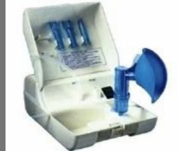
Medi Nebulizer Pro -Flaem Nuova Italy