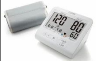
Citizen Upper Arm Blood Pressure Monitor