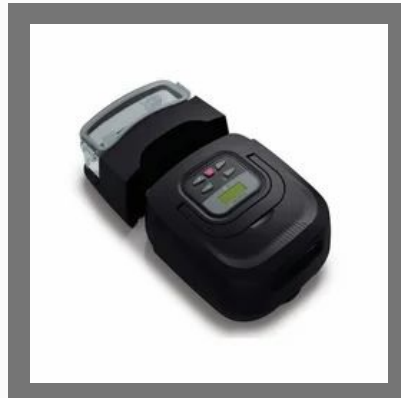
Resmart Bmc Auto CPAP