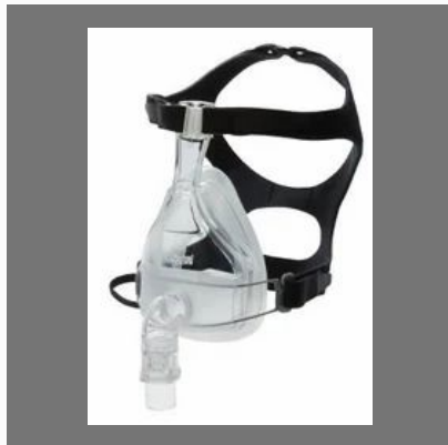
Fisher & Paykel Flexifit 431 Full Face Mask