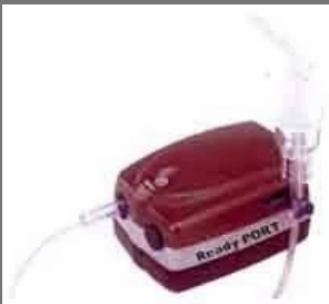
Ready Medical Port Portable Nebulizer