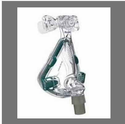
Resmed Mirage Quattro Full Face Mask