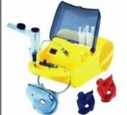
Baby NEB-Flaem Nuova-Italy Medical Nebulizer Machine