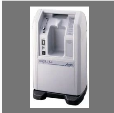
Airsep Newlife Elite