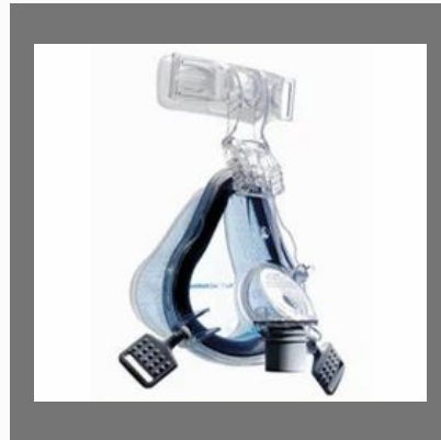
Philips Comfort Gel Full Face Mask