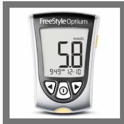
Abbott Freestyle Optium