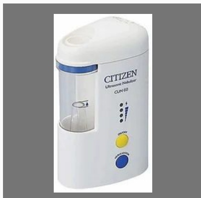
Portable Medical Ultrasonic-Silent-Rechargeable Nebulizer