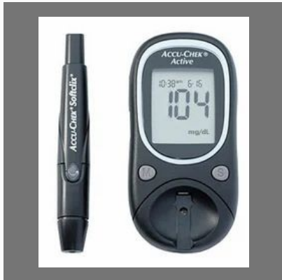
Accu-Check Active Glucometer