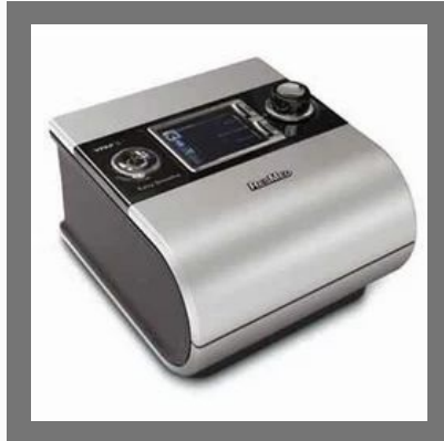
Resmed S9 Series Vpap S