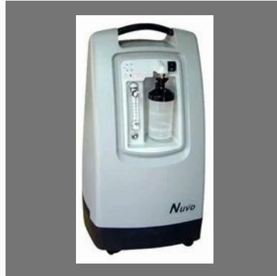
Nidek Nuvo 8 Oxygen Concentrator