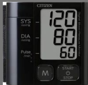
Citizen Wrist Blood Pressure Monitor