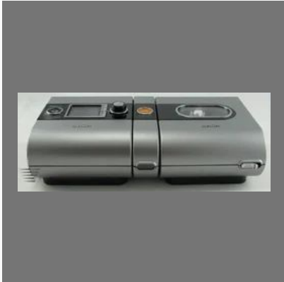
Resmed S9 Series Vpap St-a With Ivaps