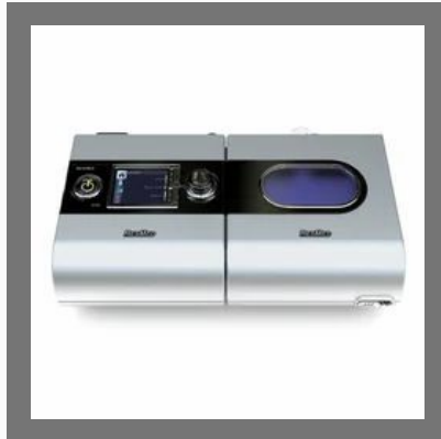
Resmed S9 Series Vpap St With Ivaps