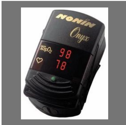
Nonin Finger Tip Pulse Oximeter