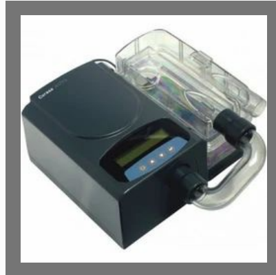
Curasa Auto CPAP