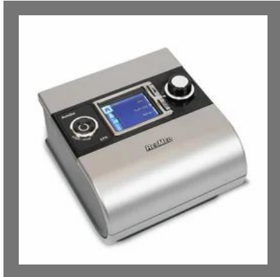
Resmed S9 Auto 25