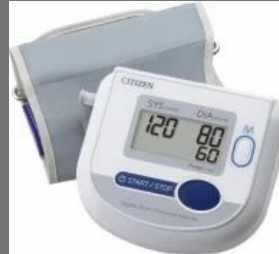
Citizen Upper Arm Blood Pressure Monitor Ch-453