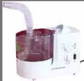
Ready Flow Hospital Medical Portable Nebulizer