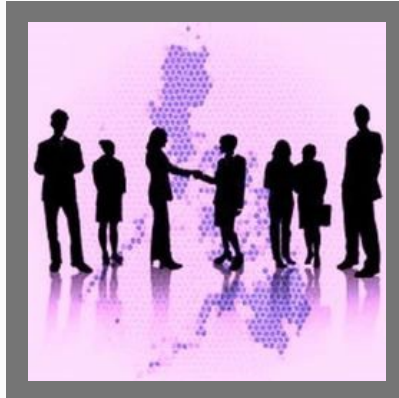
Manpower Outsourcing & Consultancy Services