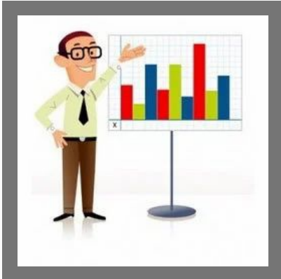
Service Tax Consultancy