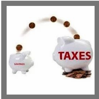
Tax Saving Schemes