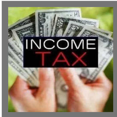
Income Tax Consulting