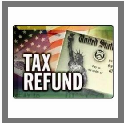
Tax Refund Processing