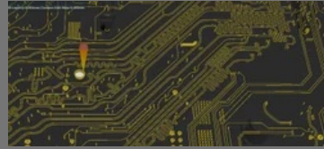
PCB Design Service