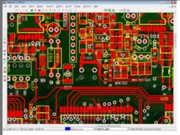
PCB Reverse Engineering Service