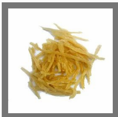
Fryums- Rice Vadagam