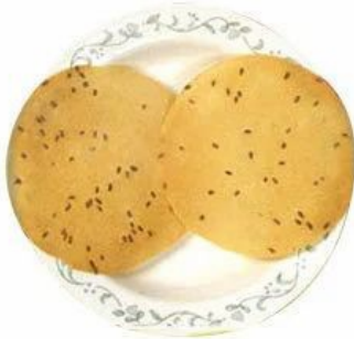
Industrial Catering Papad