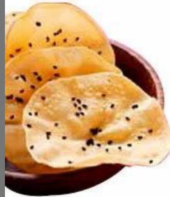
South Indian Papad