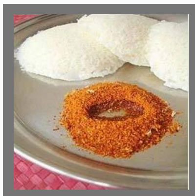
Idli and Dosa Mix