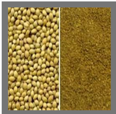
Green Coriander Powder