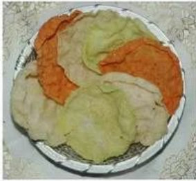
Crispy Sago Papad