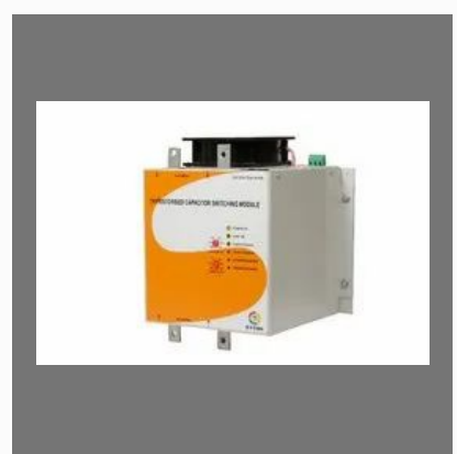
Thyristor Capacitor Switching Modules