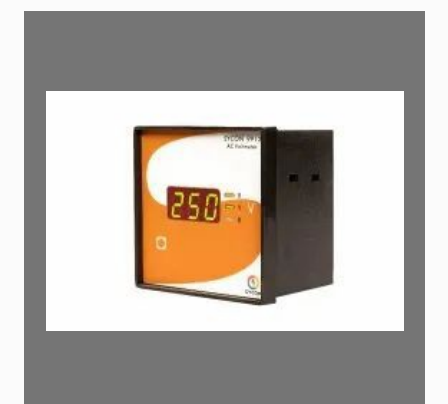
SYCON-9913 Three Phase Voltmeter