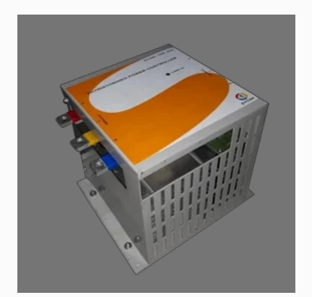
Thyristor Power Controllers