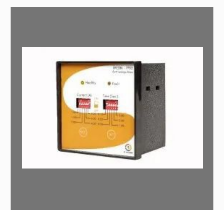
Earth Leakage Relay 77XX