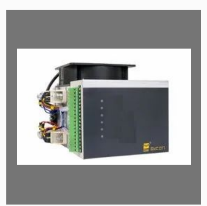
Street Light Timer