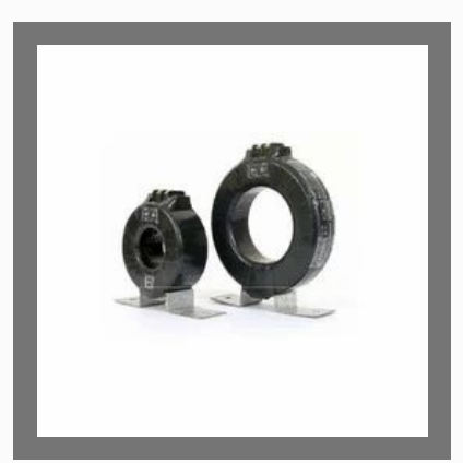
Low Tension Current Transformer