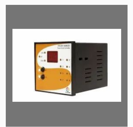
Automatic Power Factor Controller