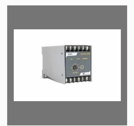
Sycon 2110 Motor Master Relay