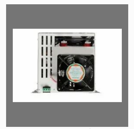
Asset Management System