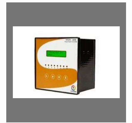
SYCON 6616 Automatic Power Factor Controller