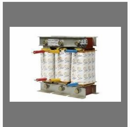
Three Phase Reactor