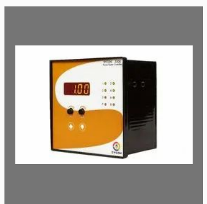
55XX Automatic Power Factor Controller