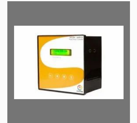
SYCON 6612SS Automatic Power Factor Controller