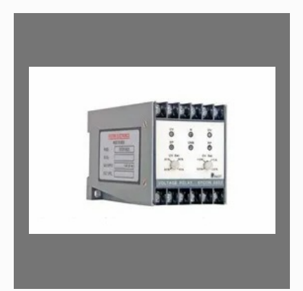
Under Voltage / Over Voltage Relay