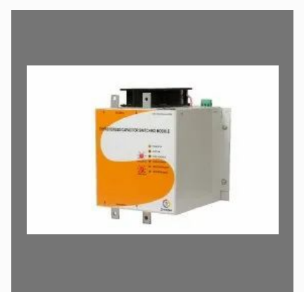
Thyristor Switching Module