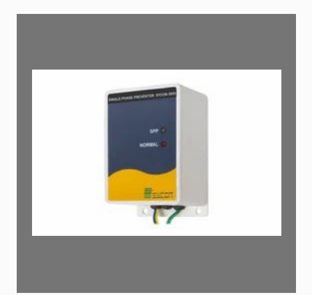
Sycon 8805 Single Phase Preventor