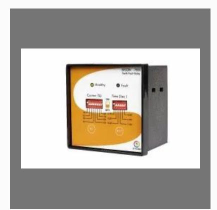
Sycon 7800 Earth Fault Relay