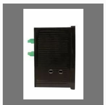
Static VAR Generator SVG