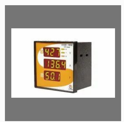
Digital VIF Meter