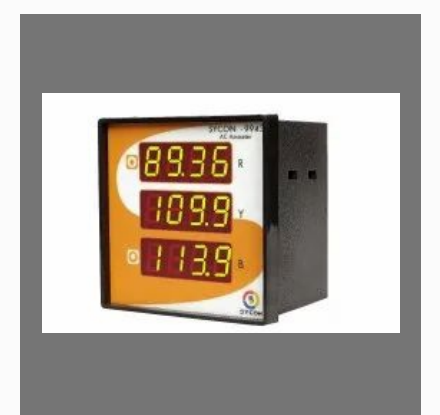
Sycon 9943 Three Phase Three Line Ammeter