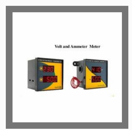
Volt And Ammeter Meter