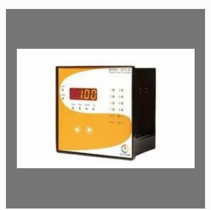
SYCON-55XX-SS Automatic Power Factor Controller