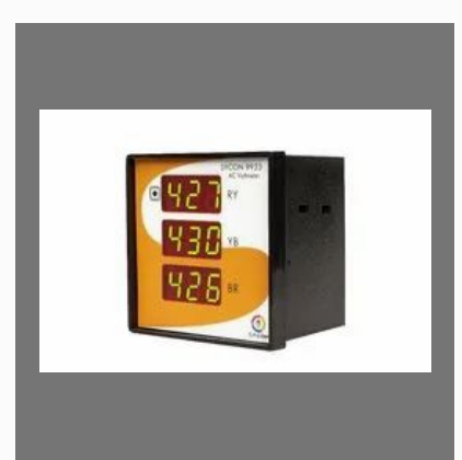
SYCON 9933 Three Phase Three Line Voltmeter