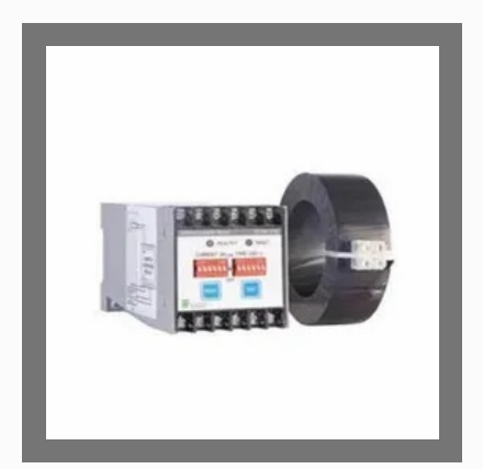
Earth Leakage Relay