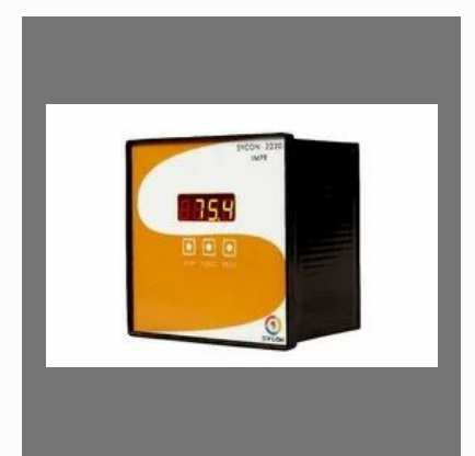
Sycon 2220 Intelligent Motor Protection Relay