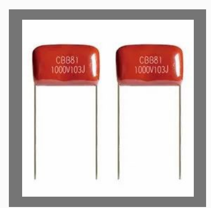
Data Logger Recorder