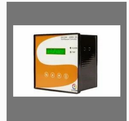
Maximum Demand Controller