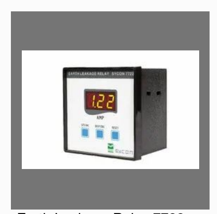
Earth Leakage Relay 7722