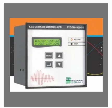
Energy Management System