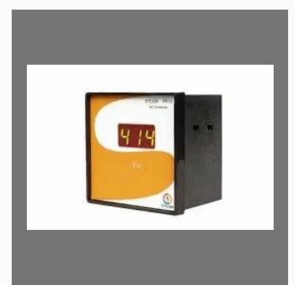
Sycon 9910 Single Phase Voltmeter