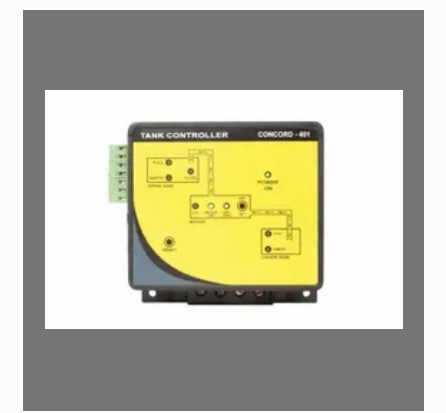
Water Tank Controller