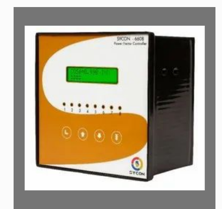
Street Light Control Panel