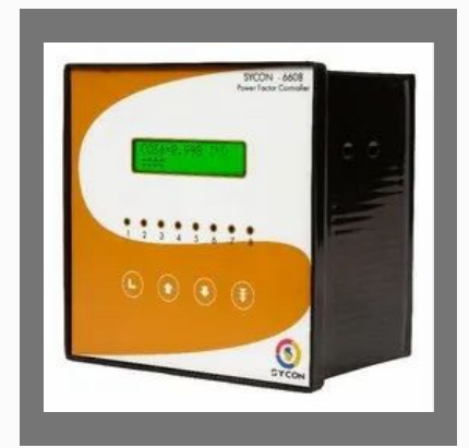
Active Harmonic Filter System