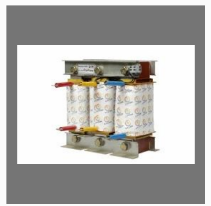
Harmonic Filter Reactor