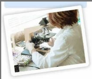
Integrated Product Development