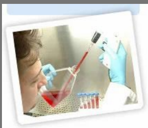
Chemistry, Manufacturing and Controls