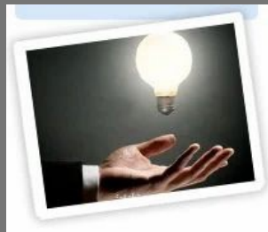
Intellectual Property Consulting