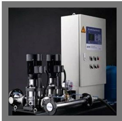
Hydro Pneumatic Pumps