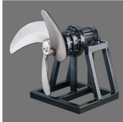
MIXER MD SERIES