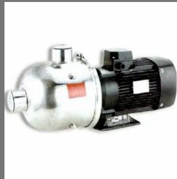
Horizontal Multistage Centrifugal Pumps