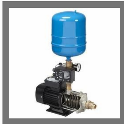
Pressure Booster Pumps