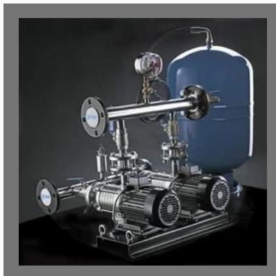
Pressure Boosting Pumps