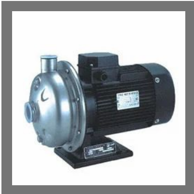
Single Stage Centrifugal Pumps