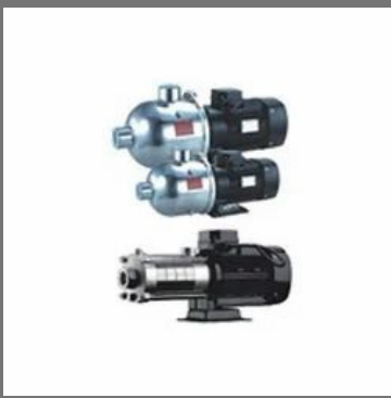
Horizontal Multistage Centrifugal Pumps