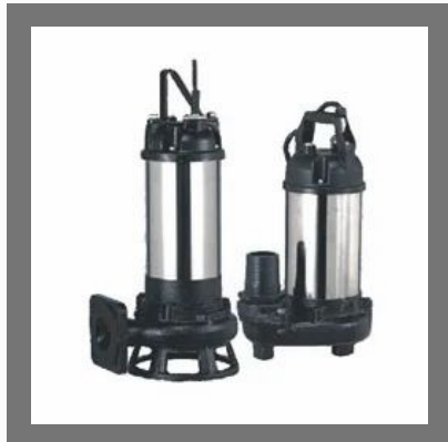
Non Clog Submersible Cutter Pumps