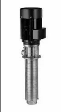
Immersible Centrifugal Pumps