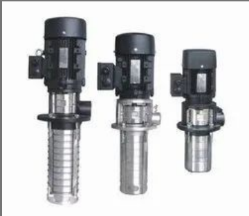
Cdlk/f Series Immersion Multistage Centrifugal Pump