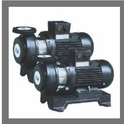
Single Stage Centrifugal Pumps