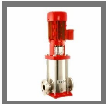
Multistage Fire Fighting Pumps