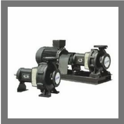
End Suction Centrifugal Pumps