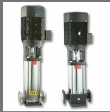
Cdl Series - Vertical Multistage Centrifugal Pump