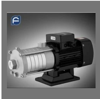
Chlf Series Horizontal Multistage Centrifugal Pump