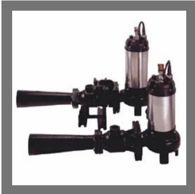
Submersible Jet Aerators