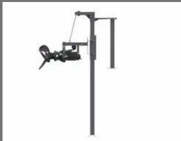
MIXER TP SERIES