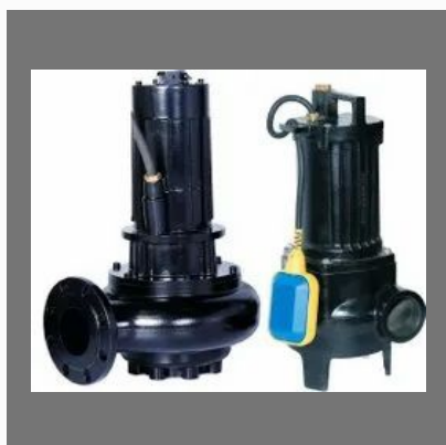
Cri Sewage Submersible Pump