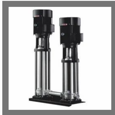
High Pressure Pumps