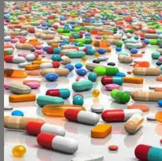
Life Style Improving Drugs