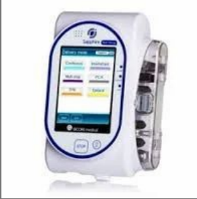
Multi Therapy Kit