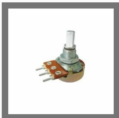
16 MM Rotary Potentiometer(ER 164-MP)