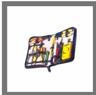
Midi Tool Kit