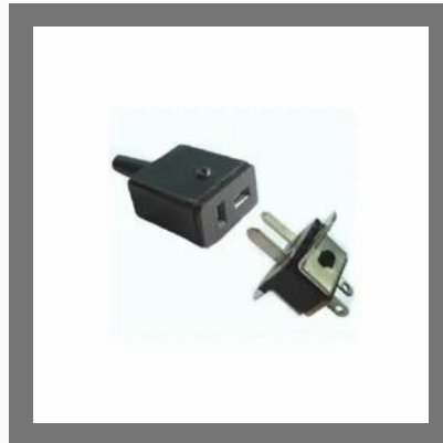
2 Pin John M/F Connector CM-Male, Plug -Female