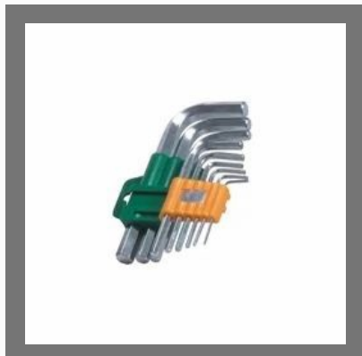
HSLK-100 (9PCS Short Series Allen Key Set)