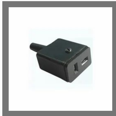
2 Pin John Female Connector