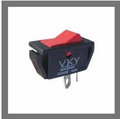
VKY Rocker Switches - Code VKY-638