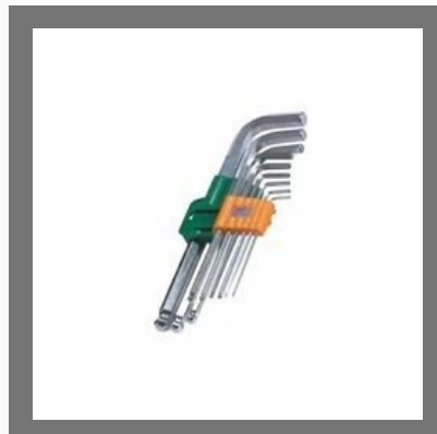
HBLK-100 (9 PCS Ball Type Long Series Allen Key Set)