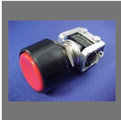
Thumb Micro Switch