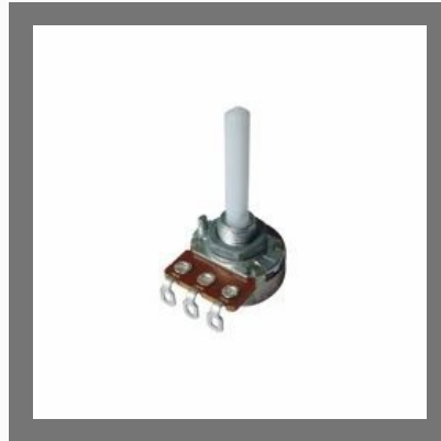
16 MM Rotary Potentiometer(ER 164-PS)