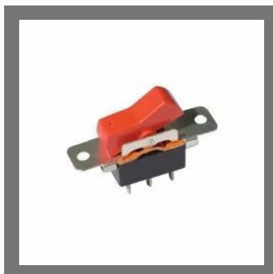
VKY Rocker Switches - Code VKY-640