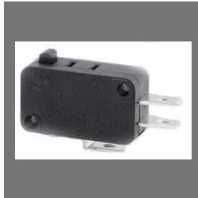
Micro Switch (LEMA)