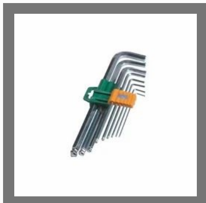
HBLK-200 (9 Pcs Ball Type Extra Long Series Allen Key Set)