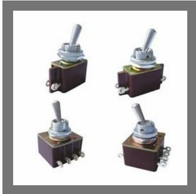
2 AMP- Metal Knob- Metal Bush