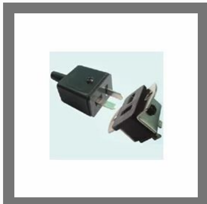
2 Pin John M/F Connector CM-Female, Plug -Male