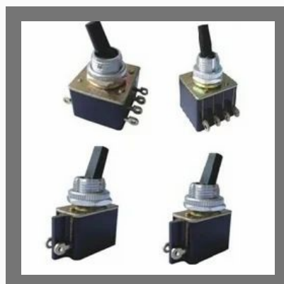
2 AMP Metal Bush/ABS Knob