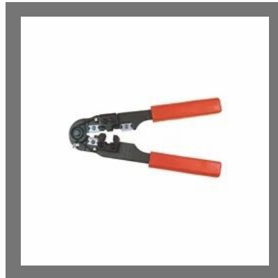
Hand Tools (MT-210A / MT-210B)