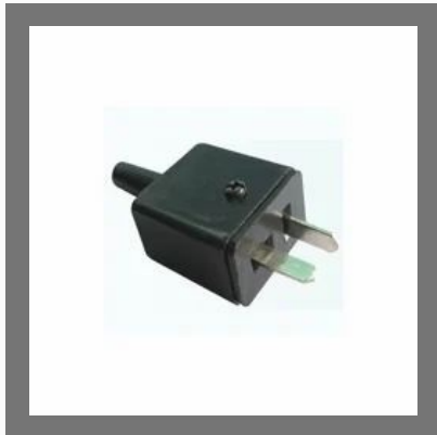
2 Pin John Male Connector (Extension)