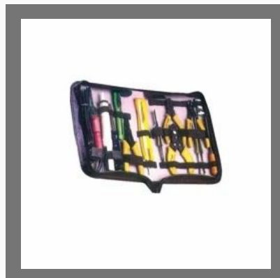
Mini Tool Kit