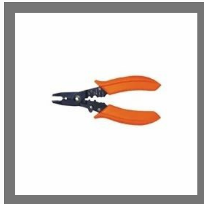
Hand Tools (CS 41 New Four Tools in One)