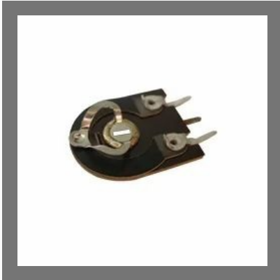
Presets (EP 185)