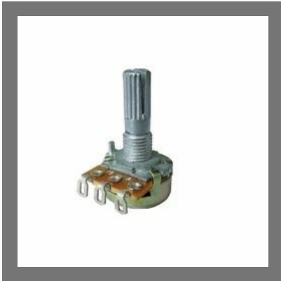
16 MM Rotary Potentiometer (ER171-B1)