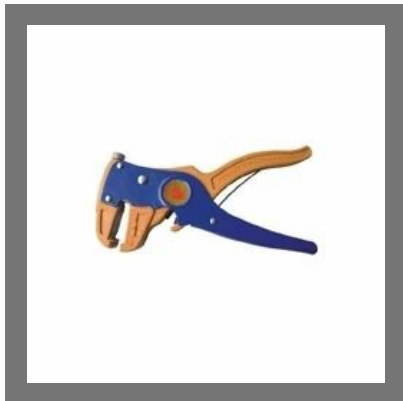
Hand Tools (02 DX)