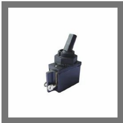
2 AMP- Plastic Bush ABS Knob