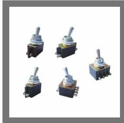
5 AMP- Metal Knob/ Metal Bush