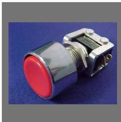
Thumb Micro Switch