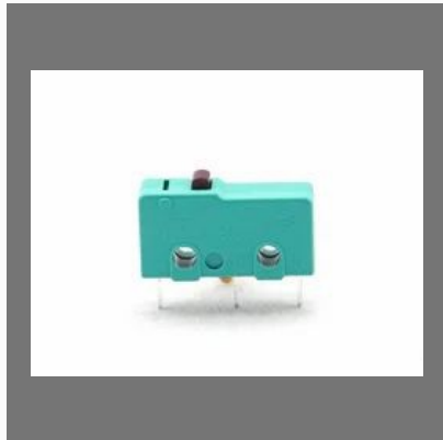
Micro Switch (lema)