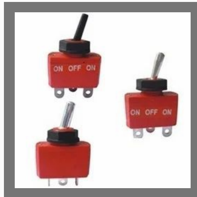
2 AMP Metal Bush Centre Off