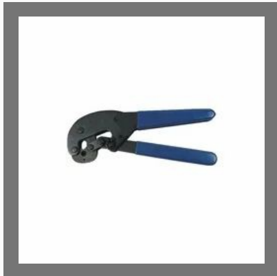
Hand Tools (MT-106f)