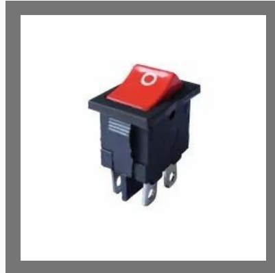
VKY Rocker Switches - Code VKY-480