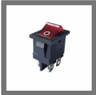
VKY Rocker Switches - Code VKY-479