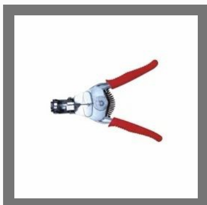
Hand Tools (CS-21)