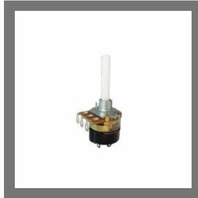
16 MM Rotary Potentionmeter(ER171-B1)