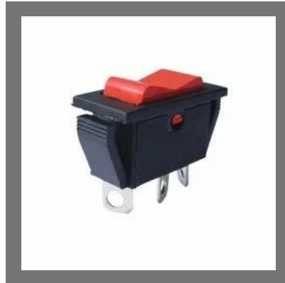
VKY Rocker Switches - Code VKY-639